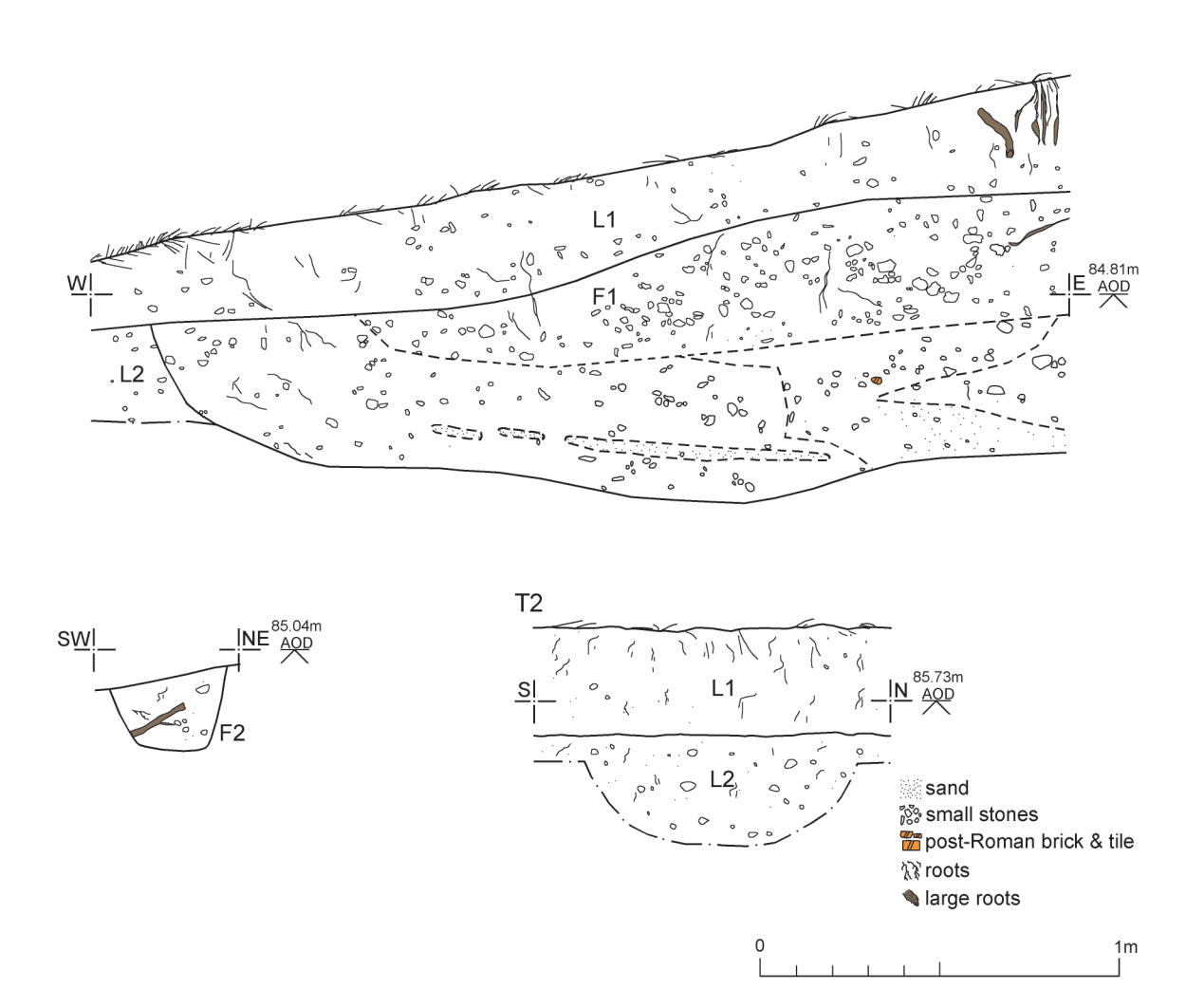
Fig 3 Feature and representative sections.