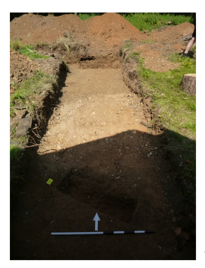
Photograph 2 Trench 1, F2 in foreground, looking north.