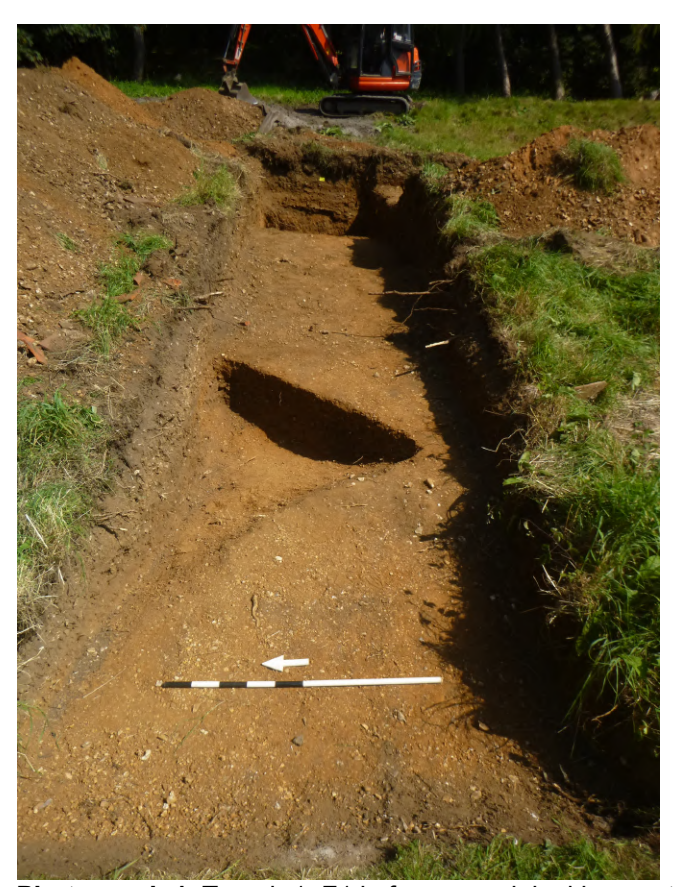
Photograph 1 Trench 1, F1 in foreground, looking east.

A full context list can be found in Appendix 1.