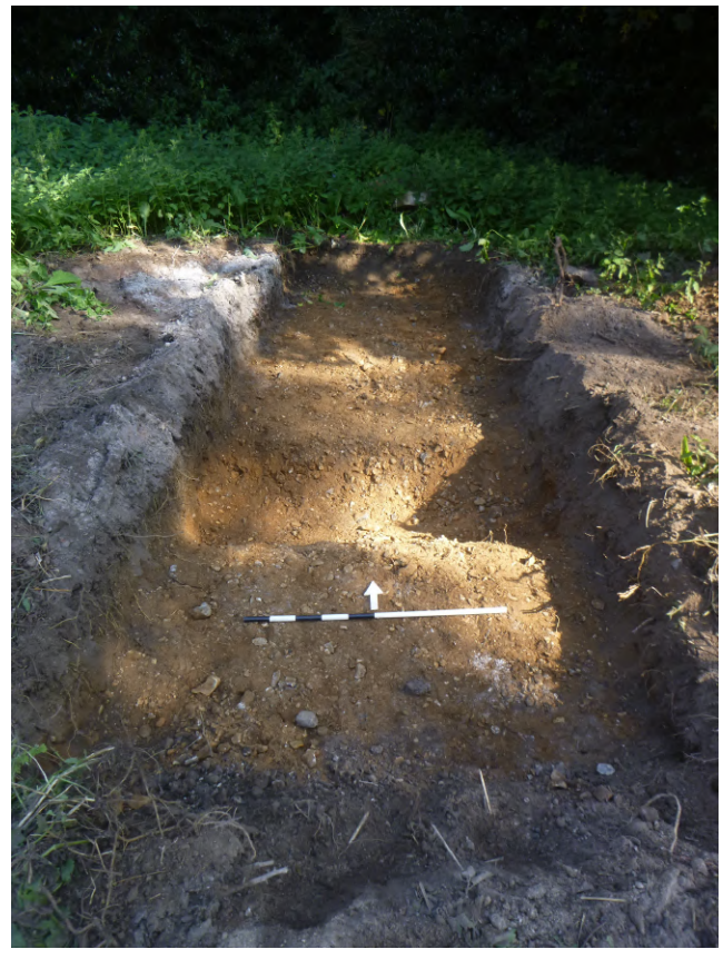
Photograph 3 Trench 2, looking north.