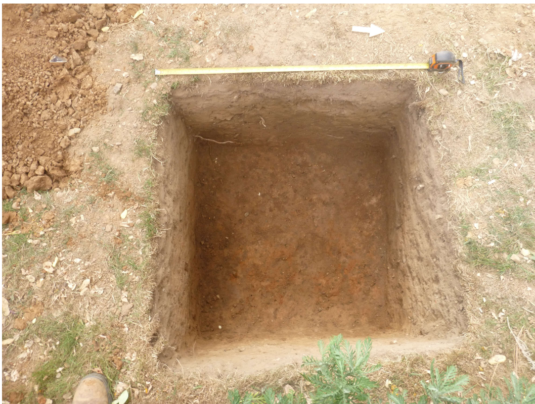
Photograph 2 Test-pit, looking west