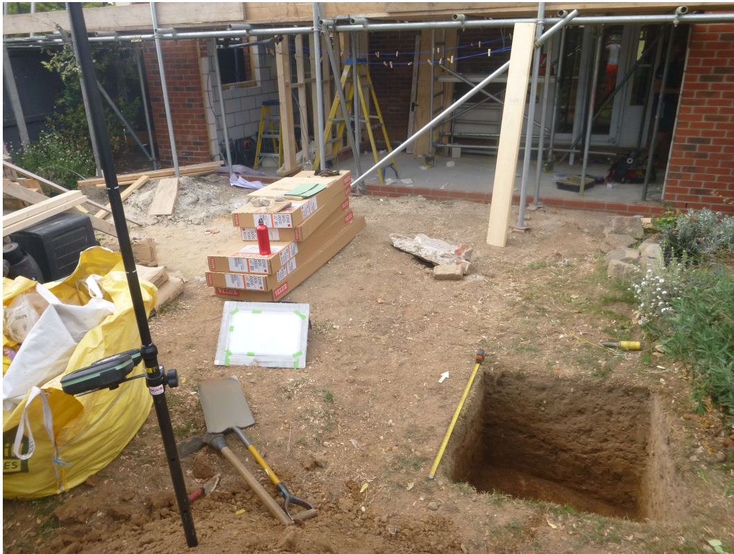
Photograph 1 Test-pit looking north-west towards the new extension.