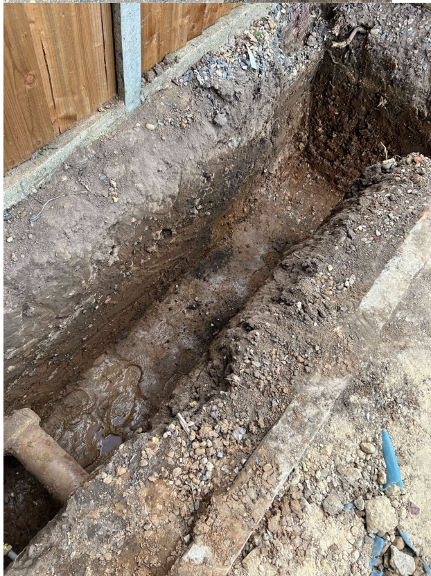
Photograph 4 Unsupervised foundation trenches