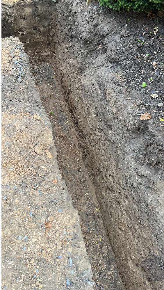
Photograph 3 Unsupervised foundation trenches