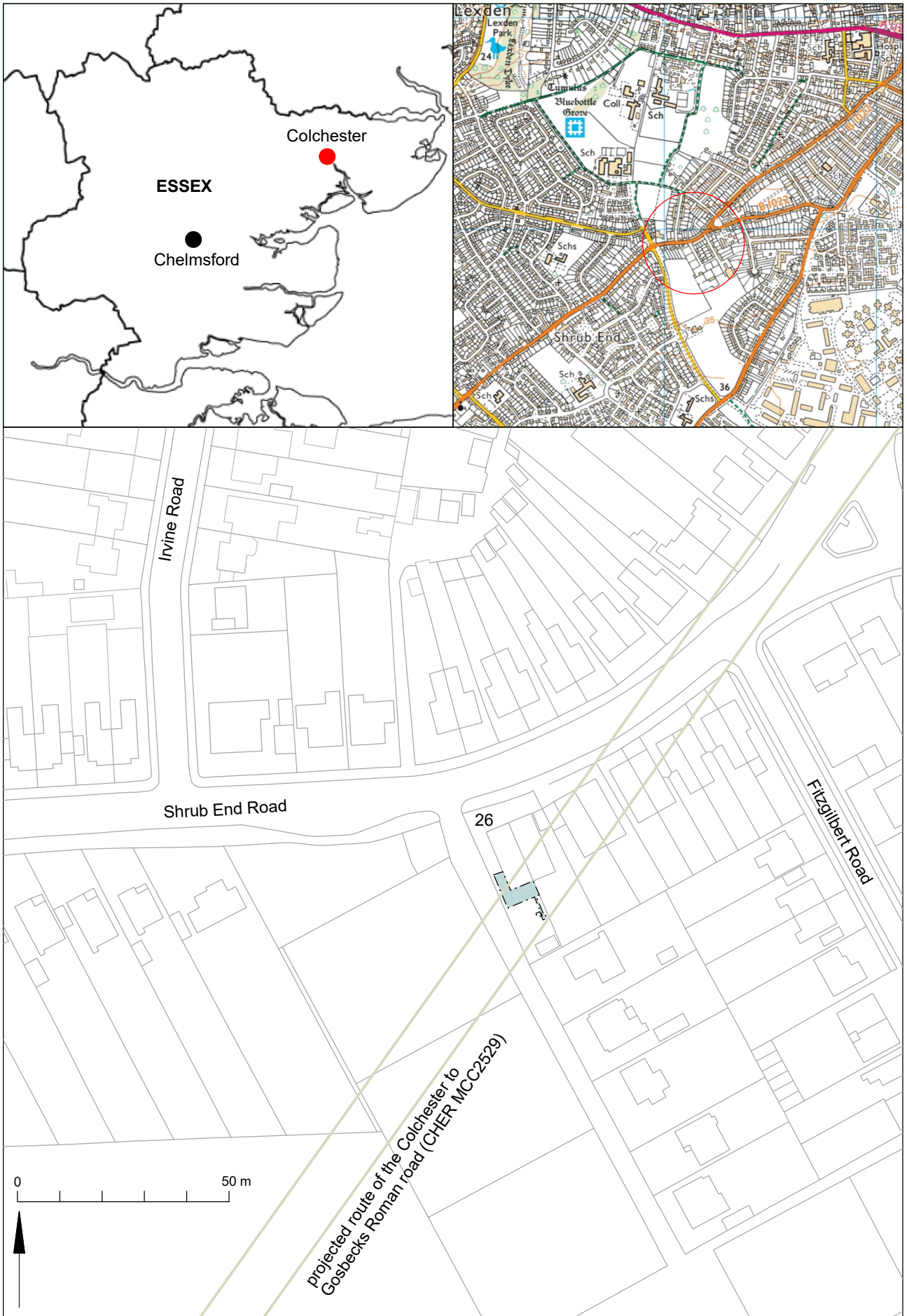
Fig 1 Site location.