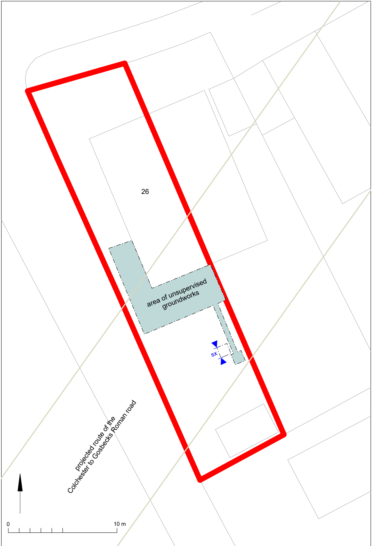
Fig 2 Results