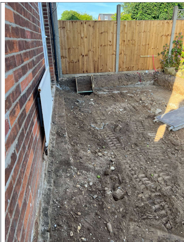
Photograph 5 Unsupervised ground reduction area inside of foundations