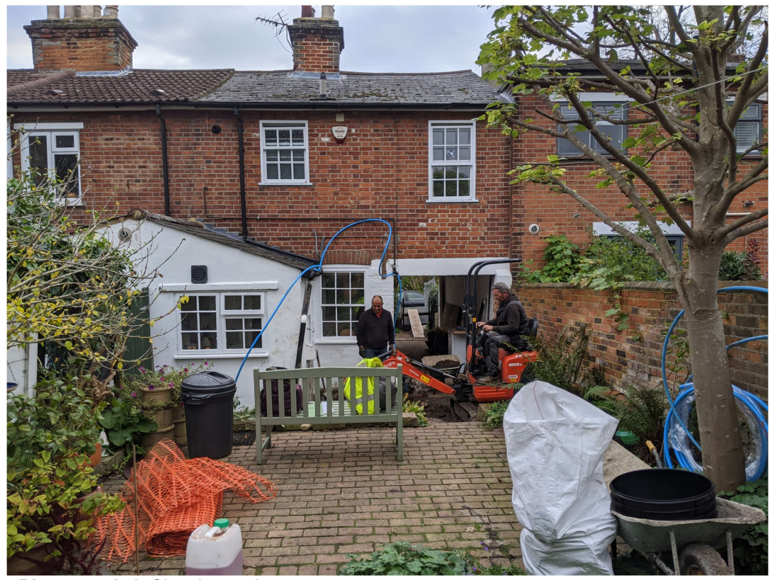
Photograph 1 Site shot - view east

An area covering approximately 2 square metres was mechanically-excavated through a make-up layer (L1, c 0.70-0.80m thick, soft, moist, dark brown loam with inclusions of brick and concrete) and into another dark silty fill (L2, c 00.70-0.80m below current ground level, soft, moist, dark grey/brown silty loam with inclusions of oyster shell, brick and tile). L2 could possibly be the fill of a large undefined feature. The trench was 0.65m wide and 1.40m deep.