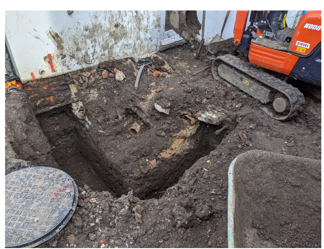
Photograph 2 Trench shot – view north-east.