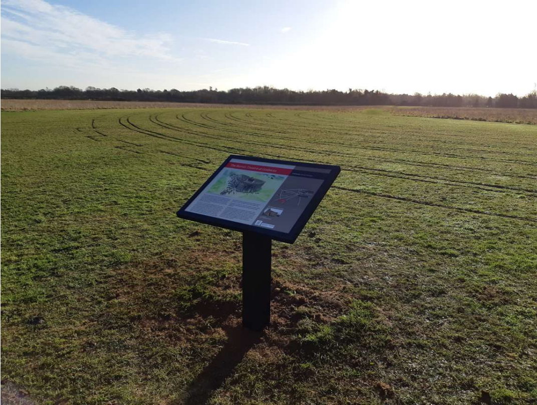
Photograph 4 Panel 2 installed, looking southeast