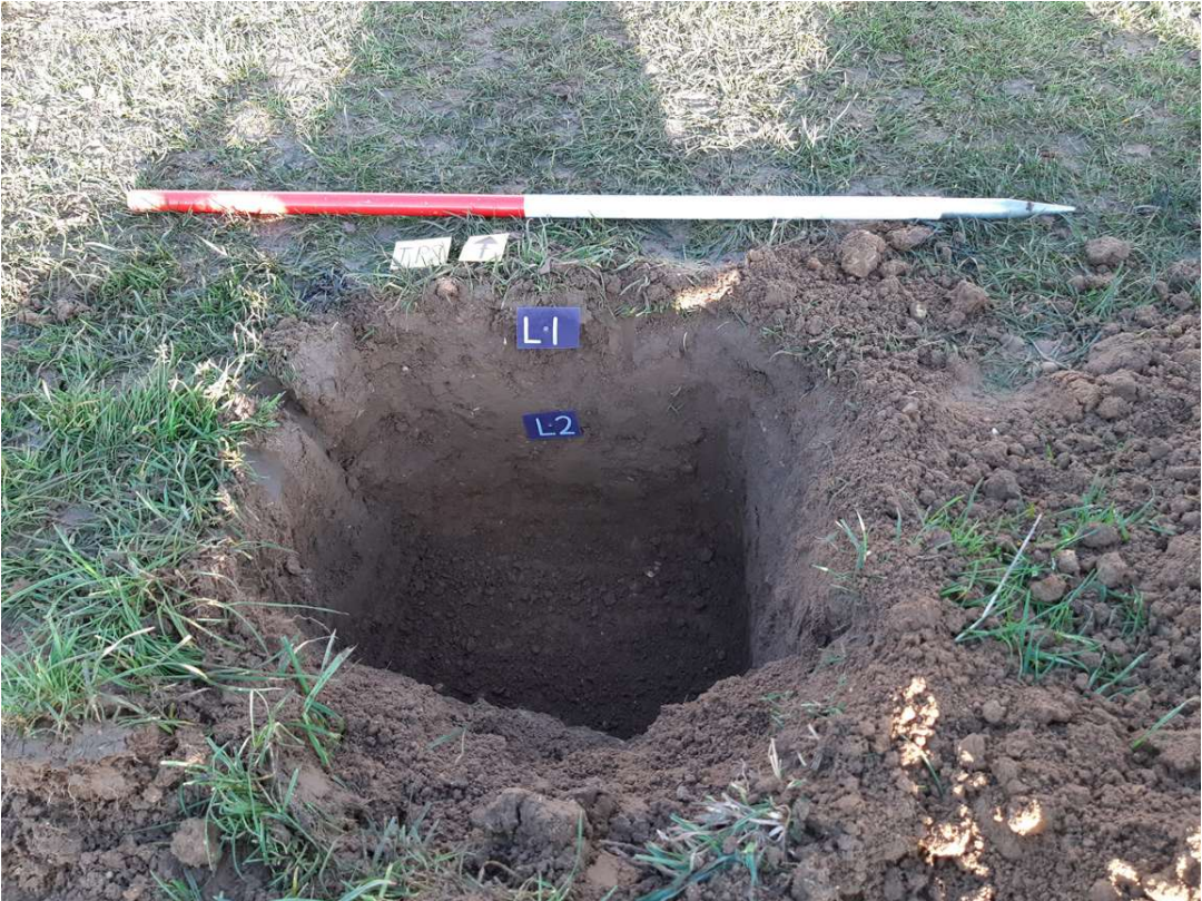
Photograph 3 Groundworks for panel 2, looking north