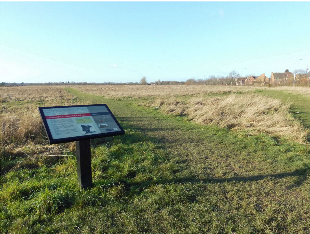
Photograph 5 Panel 3 installed, looking west