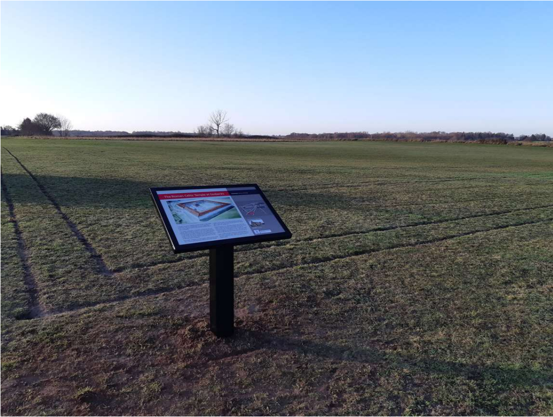
Photograph 2 Panel 1 installed, looking southwest