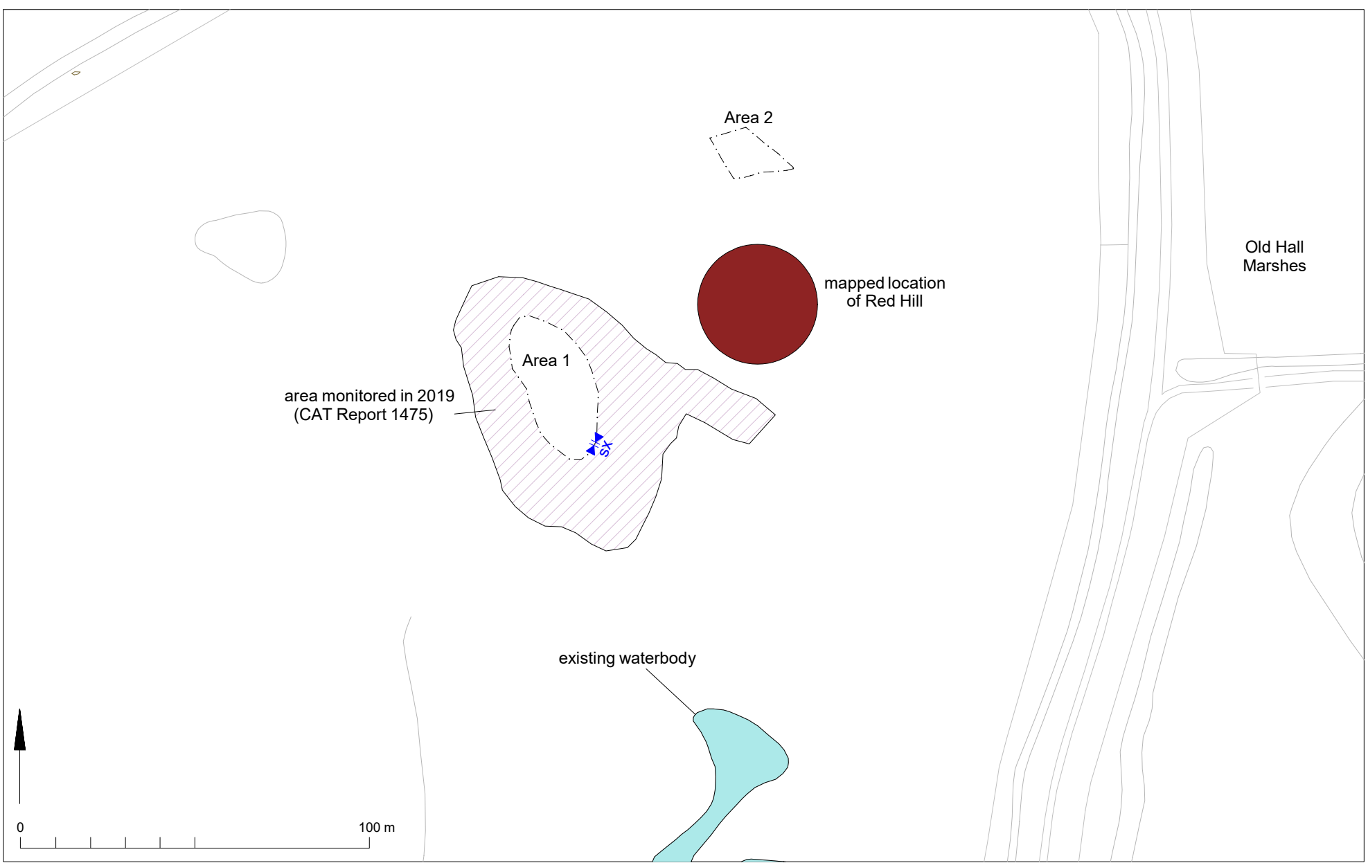
Fig 2 Monitoring results.