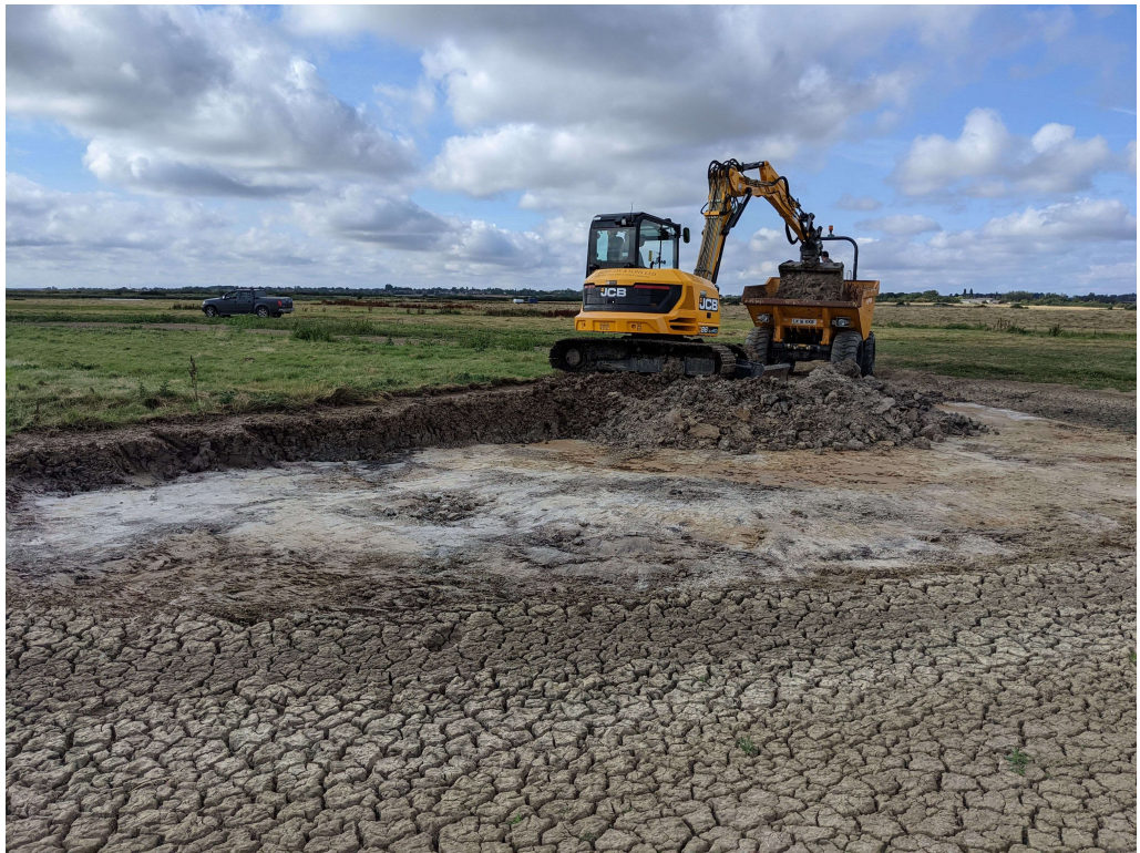
Photograph 1 Area 1, looking south-west.

0.2m through topsoil, so the strip did not go deep enough to impact any archaeological remains sealed beneath. Topsoil was a solid, mid-grey silty-clay with charcoal flecking, and natural a hard, light grey and orange-brown mottled clay.