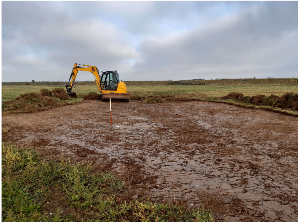
Photograph 2 Area 2, looking roughly north-west