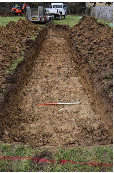
Photograph 4 T2 long shot. Photograph taken facing north-west.

No features were encountered within T2 or T3.