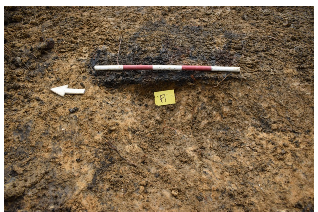
Photograph 2 Post-medieval/modern pit F1. Photograph taken facing east.

Three features were encountered, all located with T1. F1 was a shallow post-medieval/ modern pit in the west end of the trench, measuring 0.86m x 0.69m and 0.03m in depth. Adjacent to this was F2, a north-east/south-west aligned modern boundary ditch, measuring 1.85m wide and 0.66m deep. The section through this feature was machine excavated. Finally, in the northern part of the trench was F3, a north/south aligned modern linear/service run, measuring between 0.68-1.00m in width. F3 was excavated to a depth of 0.16m before modern plastic was recovered from its fill and excavation was halted.