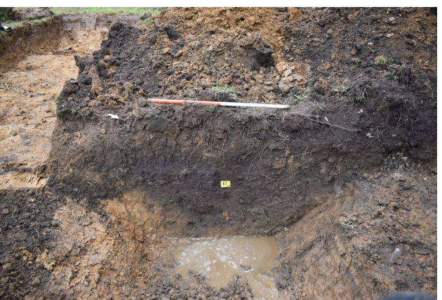
Photograph 3 Modern ditch F2 section. Photograph taken facing south-west.

CAT Report 1641: Archaeological evaluation by trial-trenching on land adjacent to White Ash House, Braintree Road, Gosfield, Braintree, CM7 5PA – February 2021