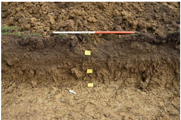
Photograph 1 Representative section of T3. Photograph taken facing north-east.

The evaluation trenches were excavated through three layers. Topsoil (L1, c 0.39-0.41m thick, firm moist light/medium grey/brown clayey silt) sealed subsoil (L2, c 0.20-0.22m thick, firm moist light grey/brown clayey silt), beneath which lay natural (L3, firm, moist, light yellow/orange clay), encountered at a depth of 0.59-0.63m below current ground level.