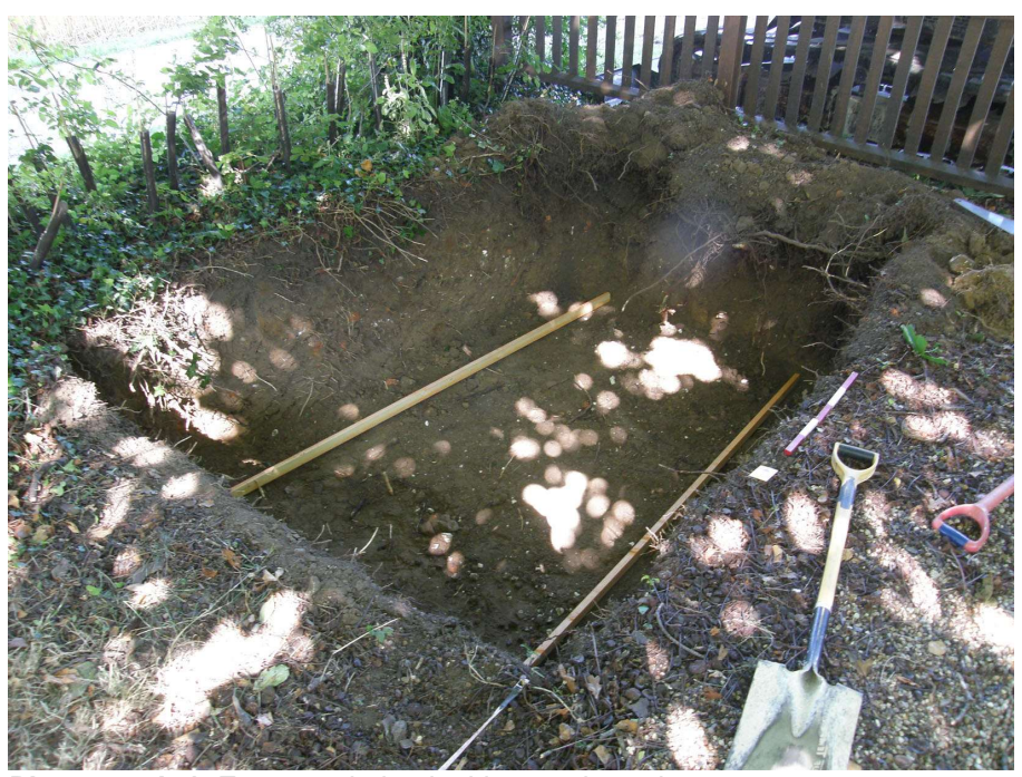
Photograph 1 Excavated pit - looking north northwest

Groundworks penetrated two layers. Modern topsoil (L1, c 0.27m thick, friable, dry dark brown sandy-silt) overlay a ?post-medieval build-up layer (L2, thick, firm/hard, dry medium/dark orange/brown sandy-silt).