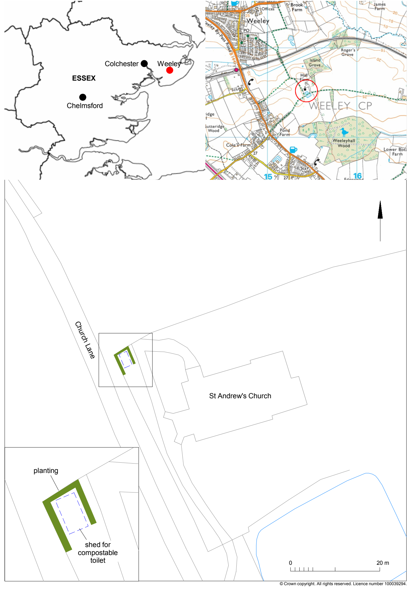
Fig 1 Site location, (monitoring area shown blue).