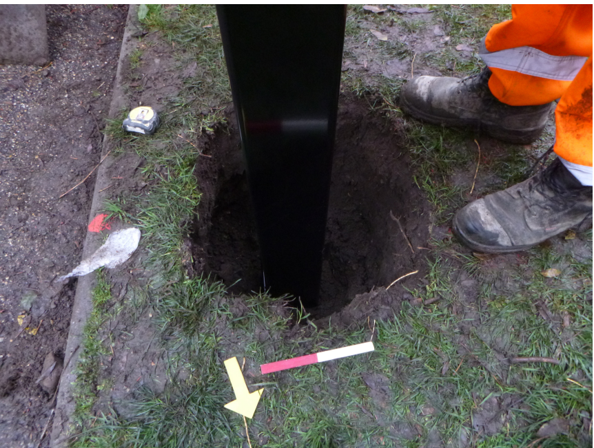
Photograph 1 Hole for interpretation panel – looking south southwest