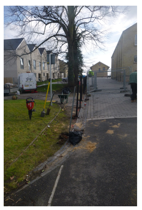
Photograph 1 Site shot