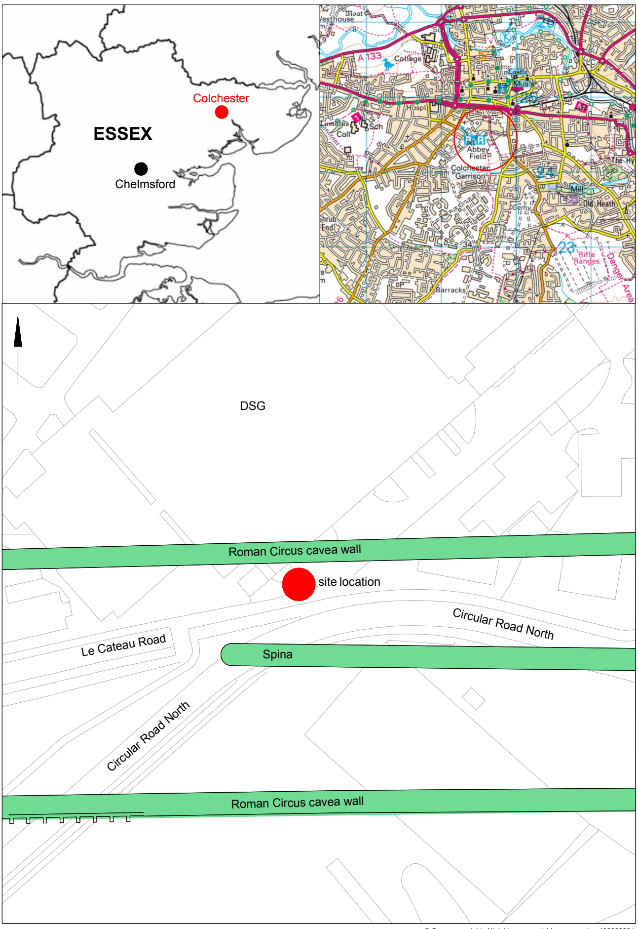
Fig 1 Site location