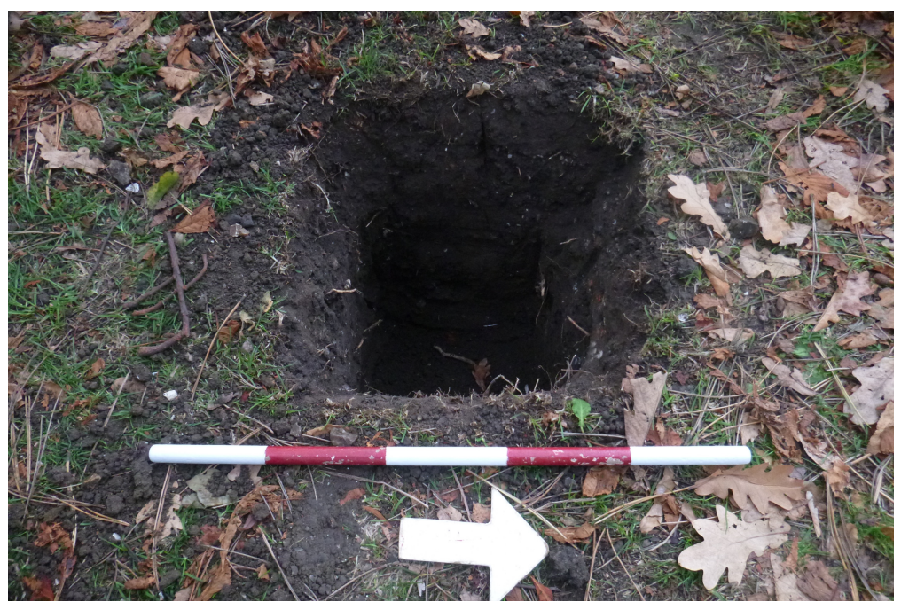
Photograph 1 Posthole - looking west

No significant archaeological remains were uncovered.