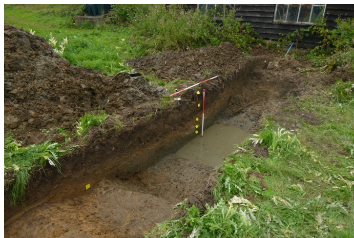
Photograph 1 F1 oblique view – looking west northwest

One trial-trench was excavated within the development site. It measured 23m in length and 1.8m in width and was positioned to capture the northwest branch of the moat. Five layers were recorded. Modern topsoil (L1, c 0.02-0.06m thick) sealed subsoil (L2, c 0.25-0.54m thick). L2 sealed a layer of backfill (L3, up to c 0.24m thick), beneath which was mixed backfill and crush (L4, up to c 0.06m thick). L4 sealed natural clay (L5). Layers L2-L4 had slumped into moat F1.