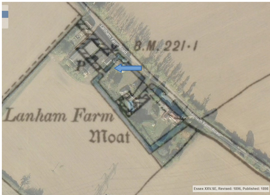
Map 1 6-inch OS map of 1895 showing the moat overlaid on modern mapping, development site indicated by a blue arrow.