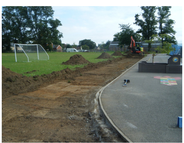
Photograph 2 Playground extension level reduction - looking south

On 21-22 August 2017, a CAT archaeologist oversaw the ground reduction to accommodate an extension to the existing hard play area. An area measuring c 201m<sup>2</sup> was reduced by 0.22m. Excavation occurred through modern topsoil (L1). No archaeological horizons were encountered as excavations did not extend beyond modern layers.