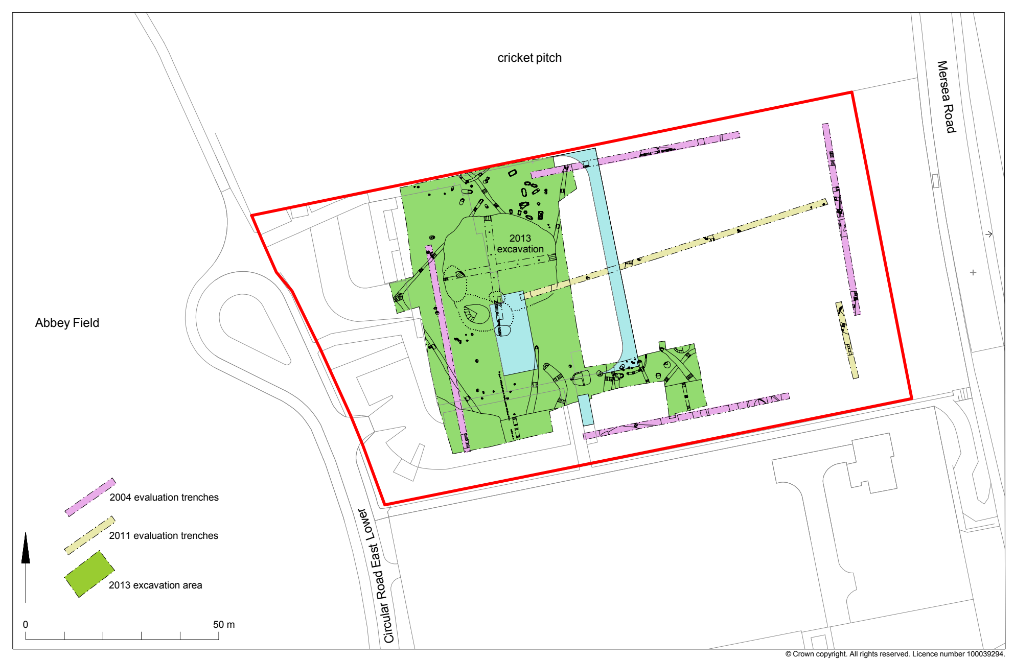
Fig 2 Monitored areas (shaded blue) in relation to previous archaeological investigations.