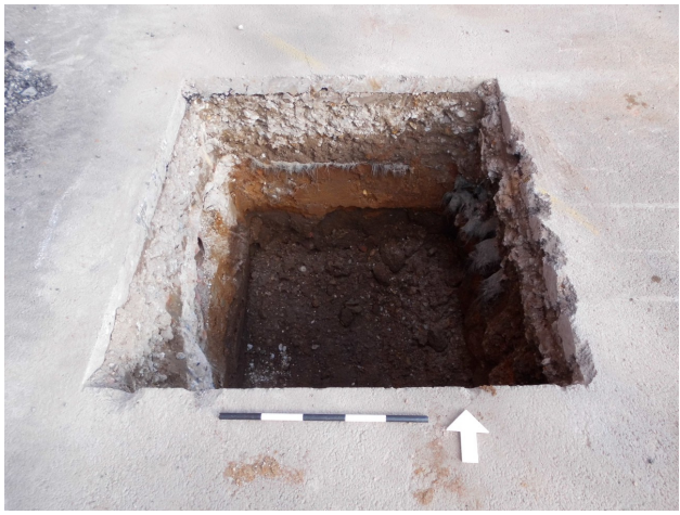
Photograph 1 Pad 2 sx - looking north

On 13 April 2017, a CAT archaeologist observed the excavation of five pads. Each pad measured 1.25-1.3m per side, and was excavated to a depth of 1.3m. Excavation occurred through modern layers only. Modern tarmac and two layers of modern crush (L2, 0.54m thick) had been laid on a thick layer of modern sand (L3, c 0.4-1.3m). Modern grey/brown silty-sand (L4) in the base of pads 2-4 was probably backfill over the 2013 excavation area (CAT Report 778). No significant archaeological horizons or natural ground level was reached during groundworks indicating a significant depth of ground stabilisation had occurred over the site before the school was built.