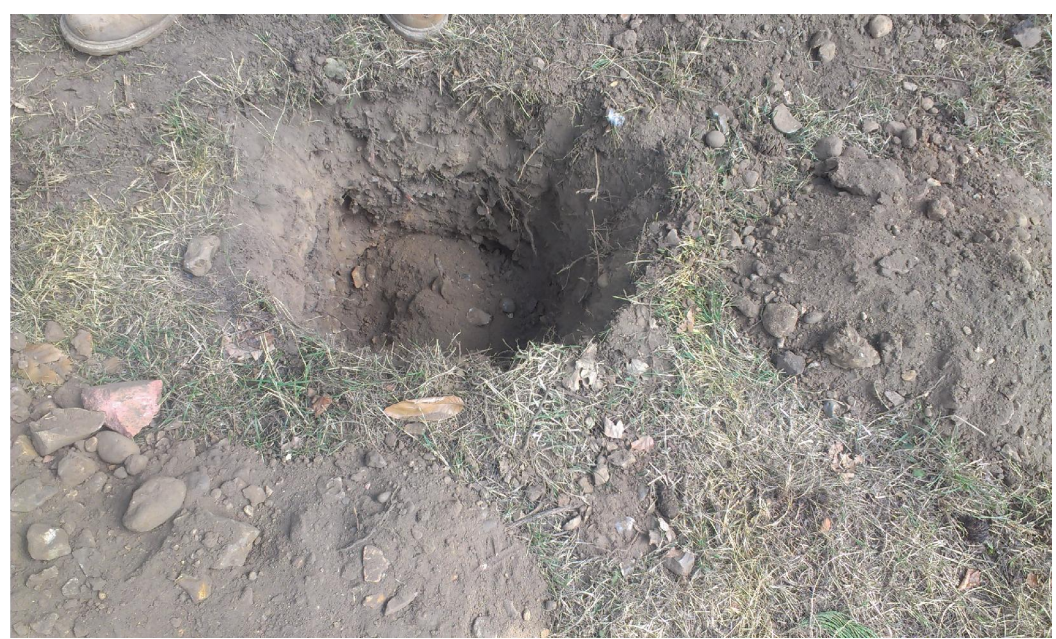
Plate 1: Partially excavated posthole for interpretation panel.