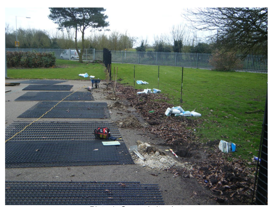
Plate 1: General site shot

Spoil heaps were trowled and metal-detected but almost all finds recovered were modern and were not retained. Only one posthole (TP4/5) contained any archaeological material. This contained a small piece of kiln or oven material. Unfortunately, due to the nature of the postholes, no context was discernable for this material.