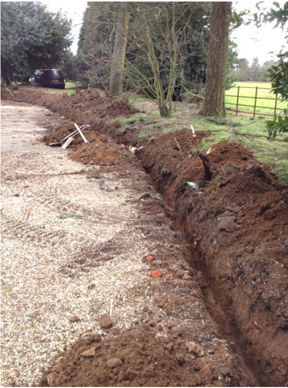
Plate 1: cable trench on western side of car park, looking SW into the paddock

Ardleigh is rich in archaeological cropmarks representing prehistoric and Romano-British burials, boundaries and settlement (Fig 2). A watching brief on the laying of an electric cable linking six lamp posts around the car park NW of Elm Park Brain Injury Services revealed no archaeological features or finds. The narrow cable trench made observation difficult. Nevertheless, the trench did not intercept any known cropmarks, nor were any previously-unknown features seen (Fig 1).