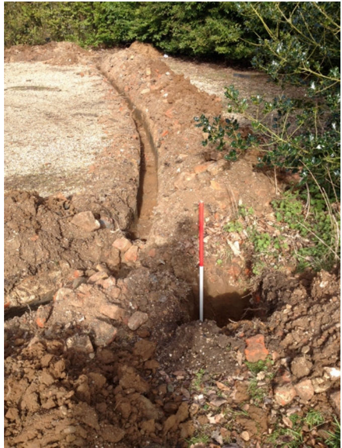
Plate 4: view west on trench on the northern side of the car park. 1-metre scale is in one of the lamp-post holes.