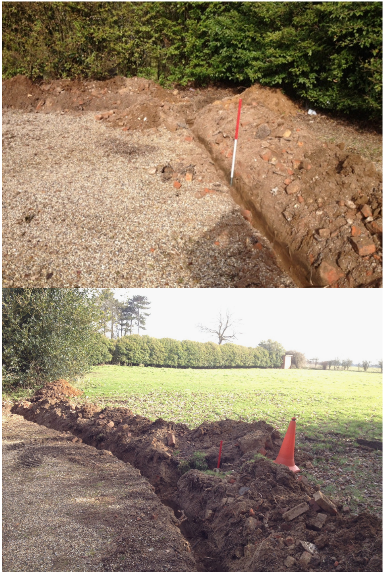
Plates 2-3: views west and north-west of the trench on the northern and eastern side of the car park

In one of the lamp-post-holes, stratigraphy was 10cm of topsoil, over 20cm of light brown clean silty clay (probably natural), over 30cm of brown sandy gravel (natural) to trench bottom. Nothing of archaeological significance was seen, nor were there any finds.