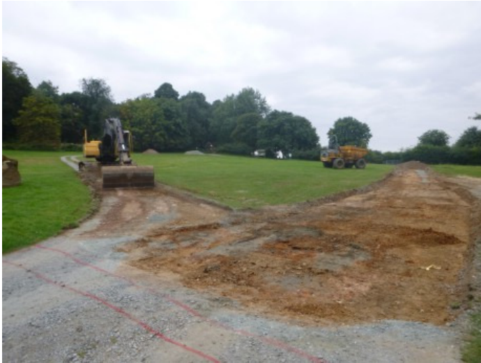
Photograph 1 Stripping of road surface revealing natural