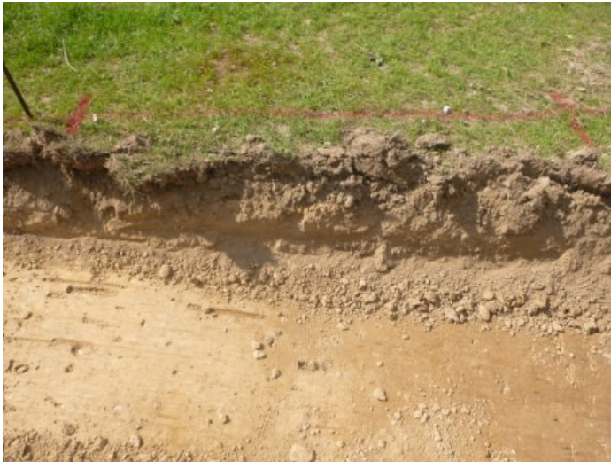
Photograph 2 Extent of ground reduction