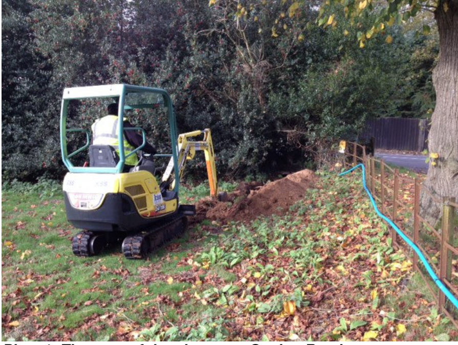
Plate 1: The start of the pipe, near Station Road

A watching brief on the laying of a new water pipe from Station Road to Elm Park Brain Injury Services revealed no archaeological features or finds. The pipe trench was very narrow (20 cm), making observation difficult. Nevertheless, the pipeline did not intercept any known cropmarks, nor were any previously-unknown features seen (Fig 2).