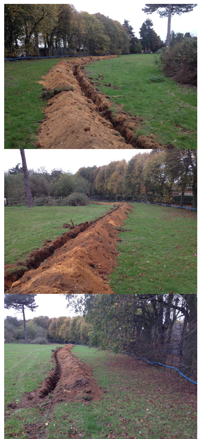
Plates 2-4: views east (top), then west along the main route of the pipe through the Paddock between Elm Park and Station Road

At the Station Road end of the pipe, stratigraphy was 20cm of topsoil, 45cm of light brown silty clay, and 10cm of slightly cleaner silty brown clay to trench bottom. In the Paddock, midway along the pipe route, the stratigraphy was 50cm of brown silty sand over 40cm of clean sandy gravel. There was much disturbance from roots in the Paddock. Nothing of archaeological significance was seen, nor were there any finds.