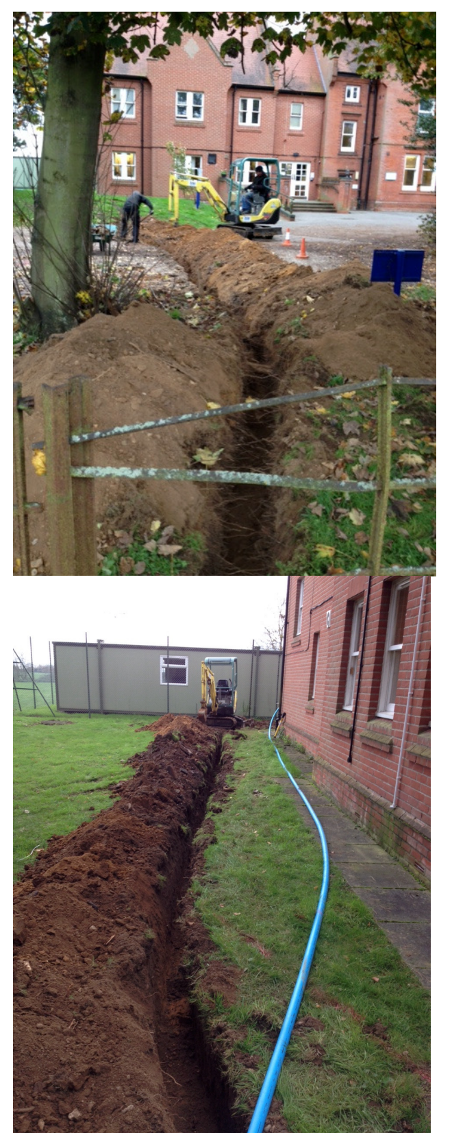
Plates 5-6: view east of pipe crossing car park and running along north side of Elm Park