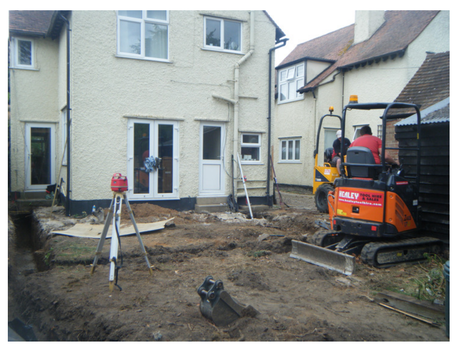
Plate 1: general site show, view NW

Drainage renewal at the southern end of the new extension involved a new soakaway (1m square) excavated to a depth of 1.2m bgl, and an associated gully run excavated to a depth of 0.3m. As with the foundation excavations, no archaeological deposits or material were seen.