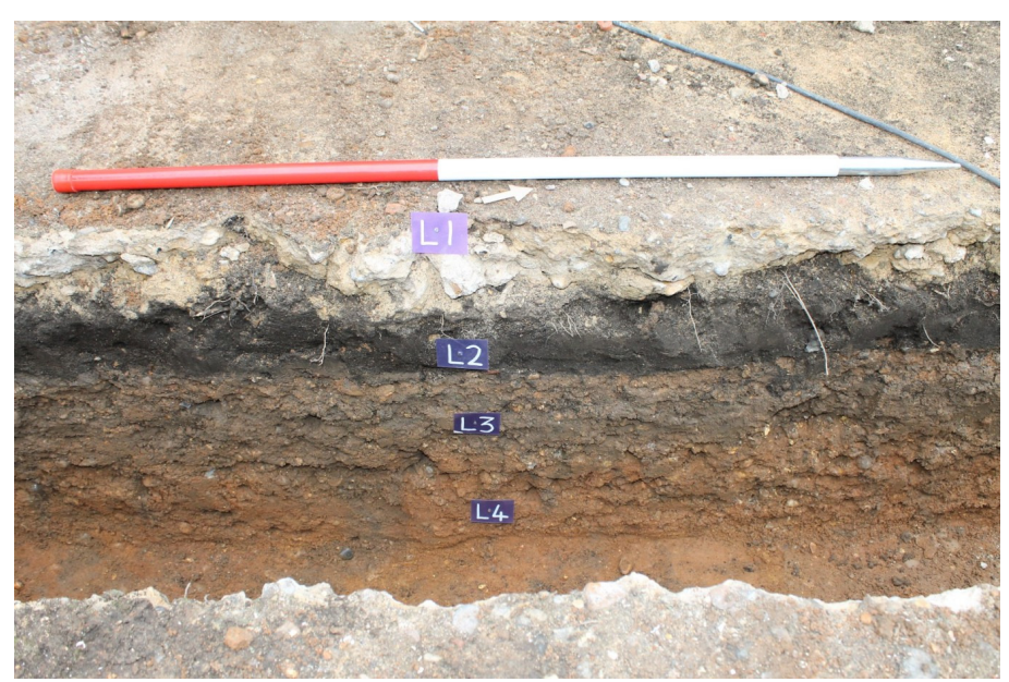
Plate 1 Representative section of L1-4, view north-west