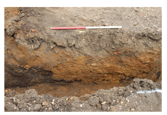
Plate 1 L1 (placed topsoil), and L2 (modern build up) visible in section of foundation trench. Shot facing east.

L1 and L2 were uncovered in the foundation trenches, and L3 and L4 were observed in the soakaway. No archaeological features were observed.