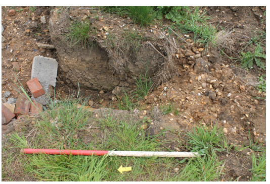
Plate 2 L3 (recent ploughsoil), and L2 (natural sand) visible in soakaway section. Shot facing east.