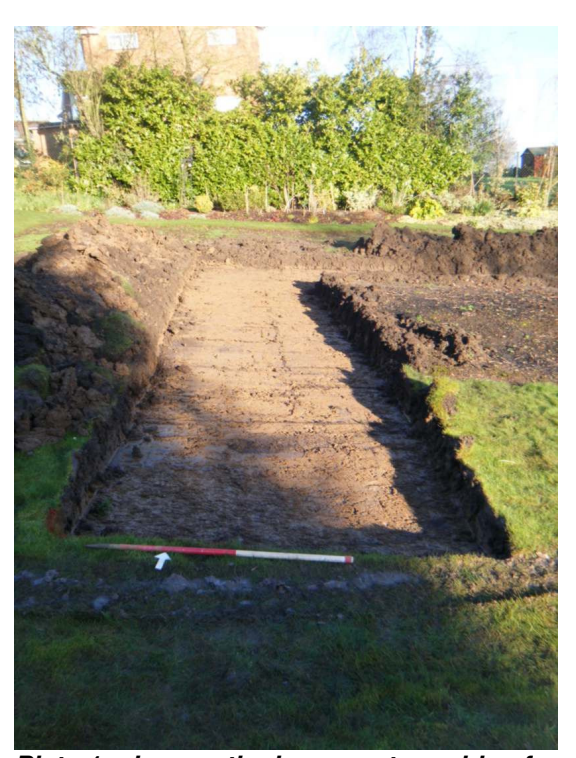
Plate 1: view north along western side of evaluation trench

This section gives an archaeological summary of the evaluation trench (T1), with context and finds dating information.