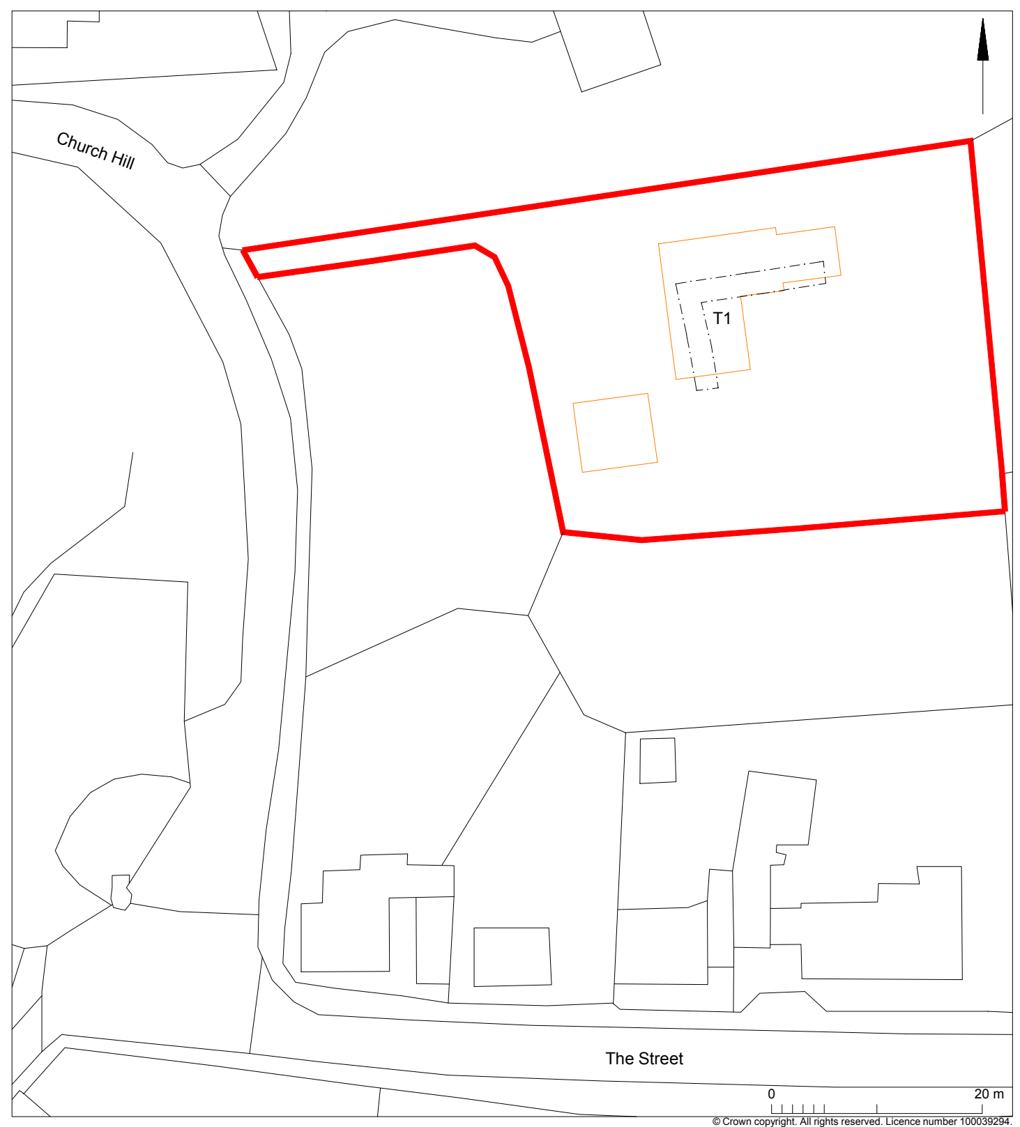
Fig 2 Evaluation results. Proposed development shown in orange.