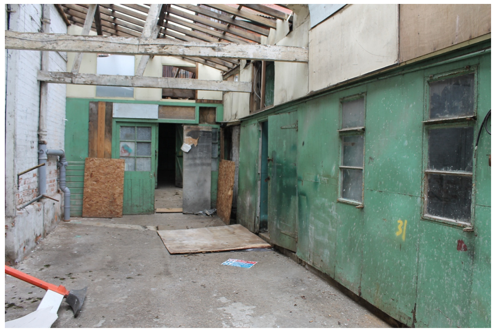
Plate 13 Inserted metal-framed windows in the south wall of the wooden shed - view west