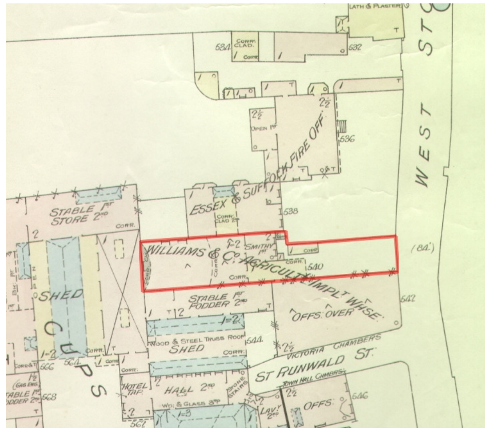
Fig 4 Insurance map, 1909.

The full extent of the complex is shown on an insurance map dating to 1909 (Fig 4).