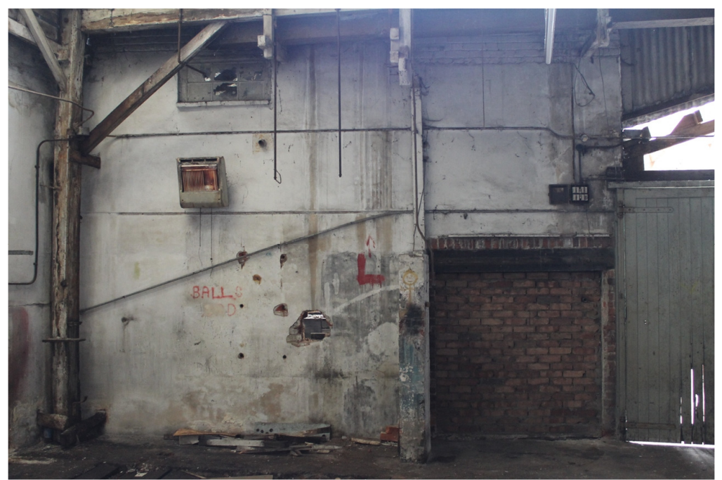
Plate 5 The replacement west wall of the converted 1830 house - view east