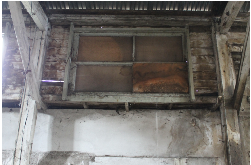
Plate 10 North wall of the workshop, showing the structure built on the adjoining property wall - view north