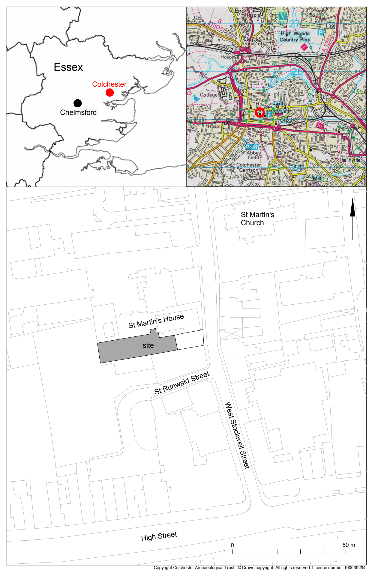
Fig 5 Site location.