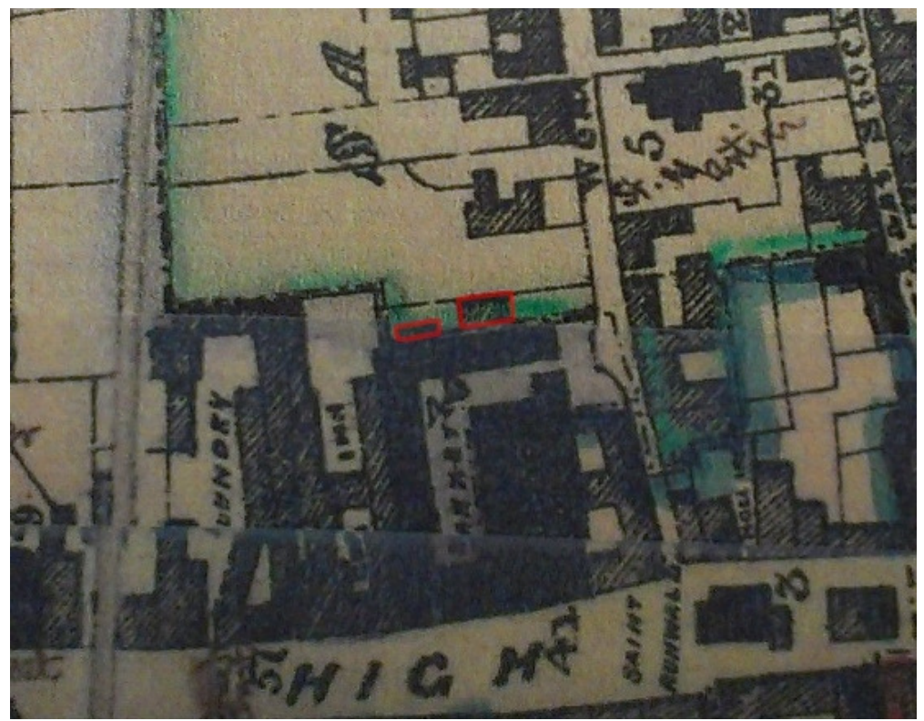
Fig 1 Monson map of Colchester, 1848.

Map evidence has been used to date these structures, although the brick building can be securely dated by a brick with the inscription 'WR 1830'. The earliest map that depicts this building is Monson's map of 1848 (Fig 1).