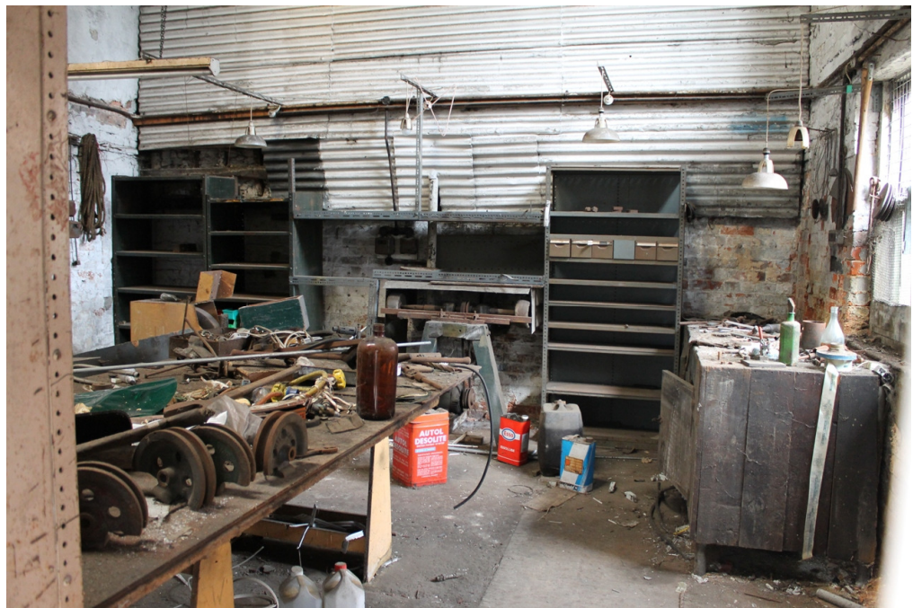
Plate 6 Interior of the converted 1830 house, showing the Williams and Co workshop - view north-west