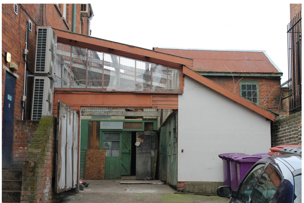
Plate 12 The 20th-century mono-pitch shed - view west