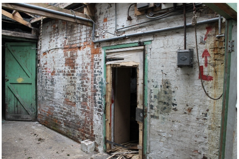
Plate 3 South elevation of the converted 1830 house, showing the inserted doorway and blocked windows – view north-west