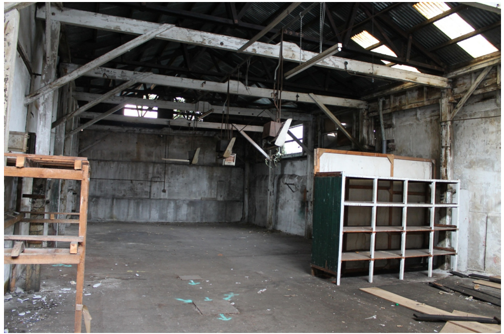
Plate 9 Interior of the workshop, showing the original timber frame and the later roof - view north-west