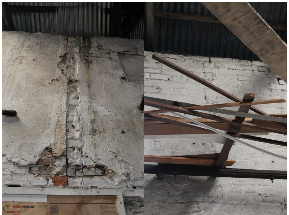
Plates 7 and 8 Evidence for the removed dividing wall in the converted 1830 house