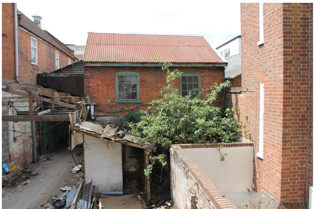
Plate 1 East elevation of the converted 1830 house - view west

Appendices Appendix 1 Selected photographs