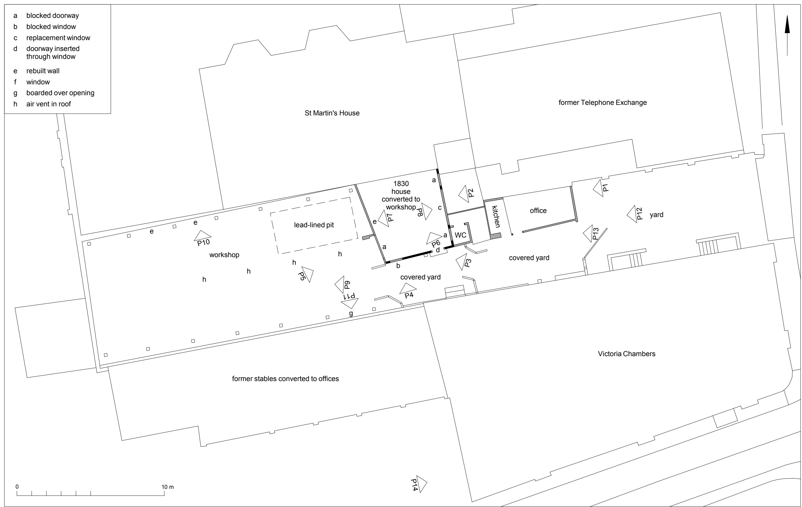
Fig 6 Plan of the site showing the location and orientation of photographs included in the report.