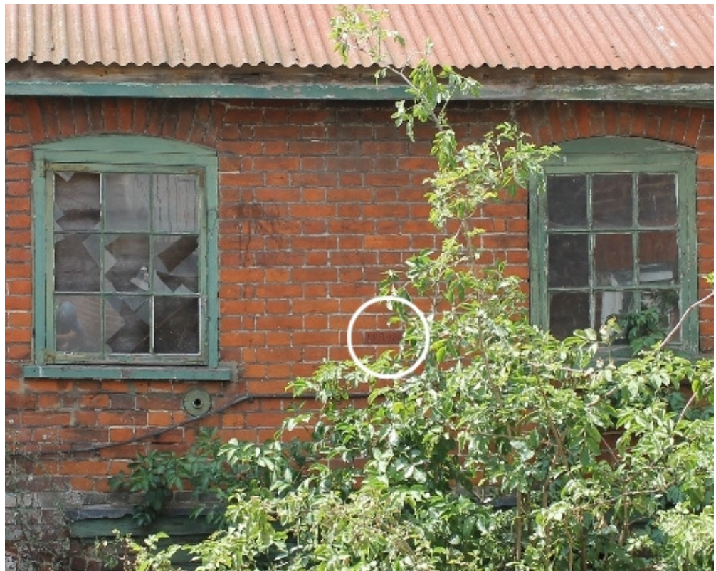
Plate 2 East elevation of the converted 1830 house with the date brick circled - view west