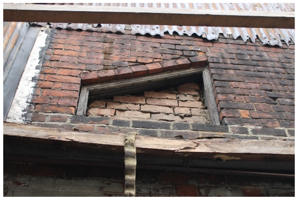
Plate 4 The rebuilt first floor wall of the converted 1830 house, showing the irregular-shaped window – view north