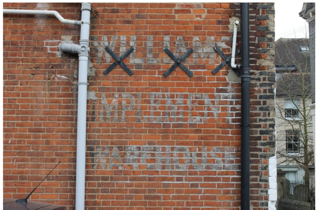
Plate 14 Painted sign on west wall of the Victoria Chambers - view east