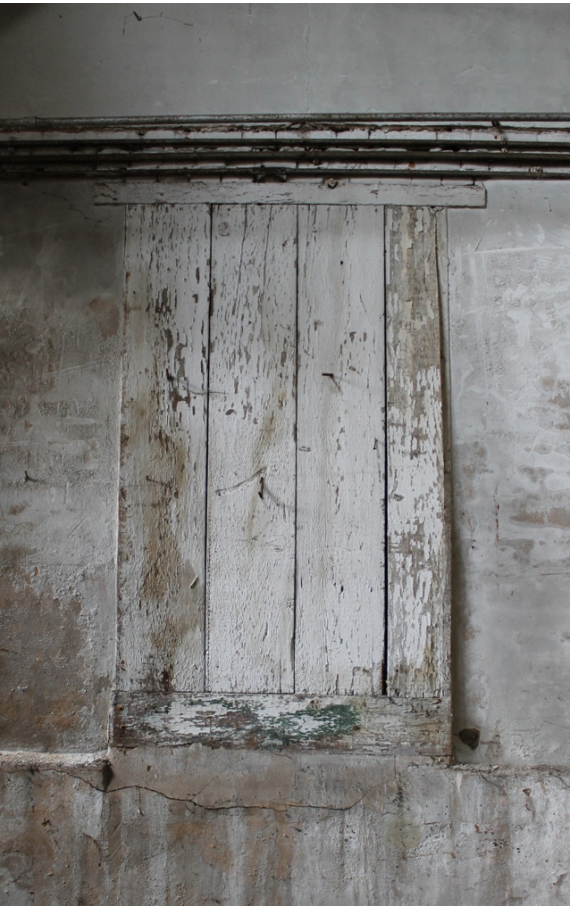
Plate 11 Possible entrance from former Cups Hotel stables into workshop – view north