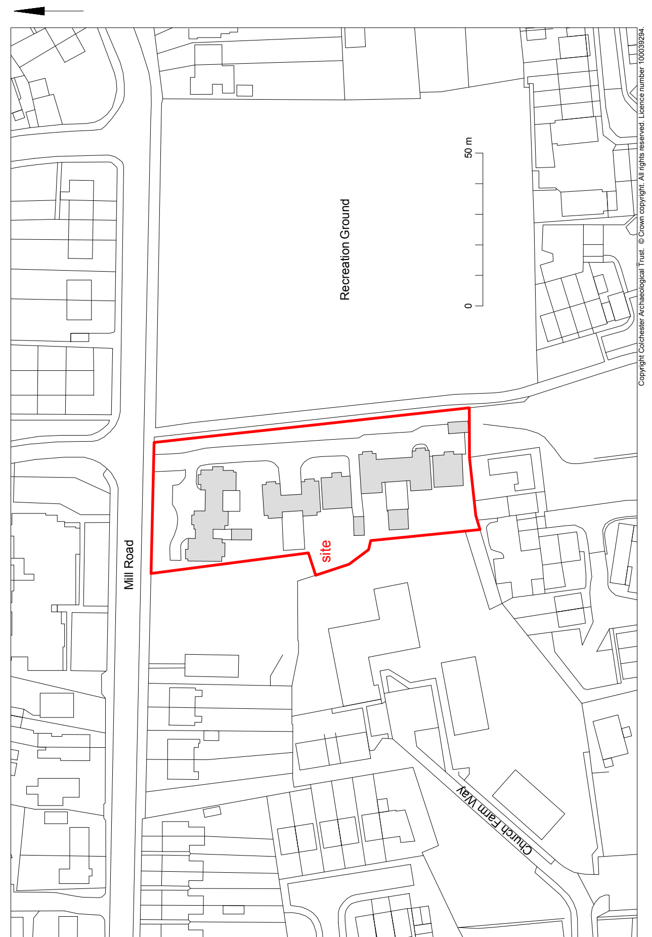
Fig 1 Site location.