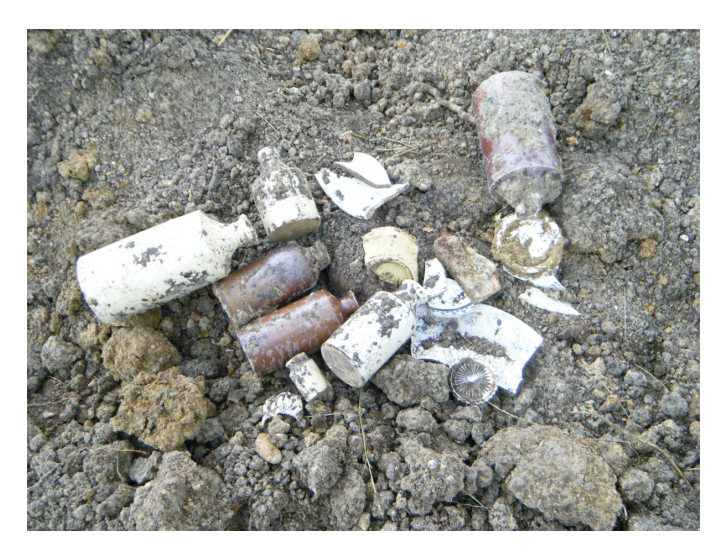
Plate 3: bottles and pottery sherds from the modern pit near the brick outbuilding.