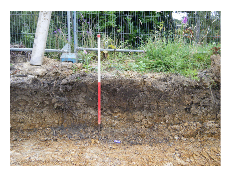
Plate 1: stratigraphy on eastern side of road.