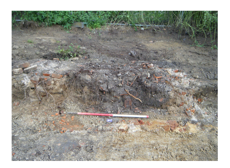
Plate 2: remains of the brick outbuilding.