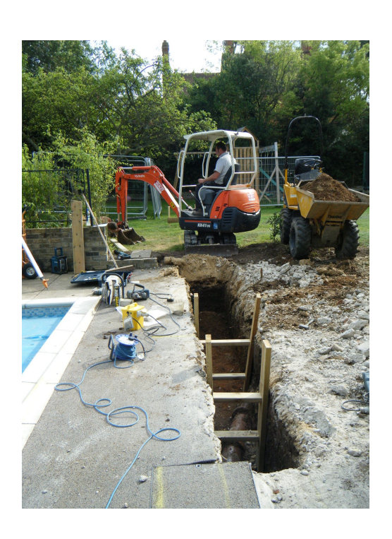
report prepared by Adam Wightman

CAT project ref.: 12/08e Colchester Museum accession code: COLEM 2012.48 NGR: TL 98546 24806 (c)