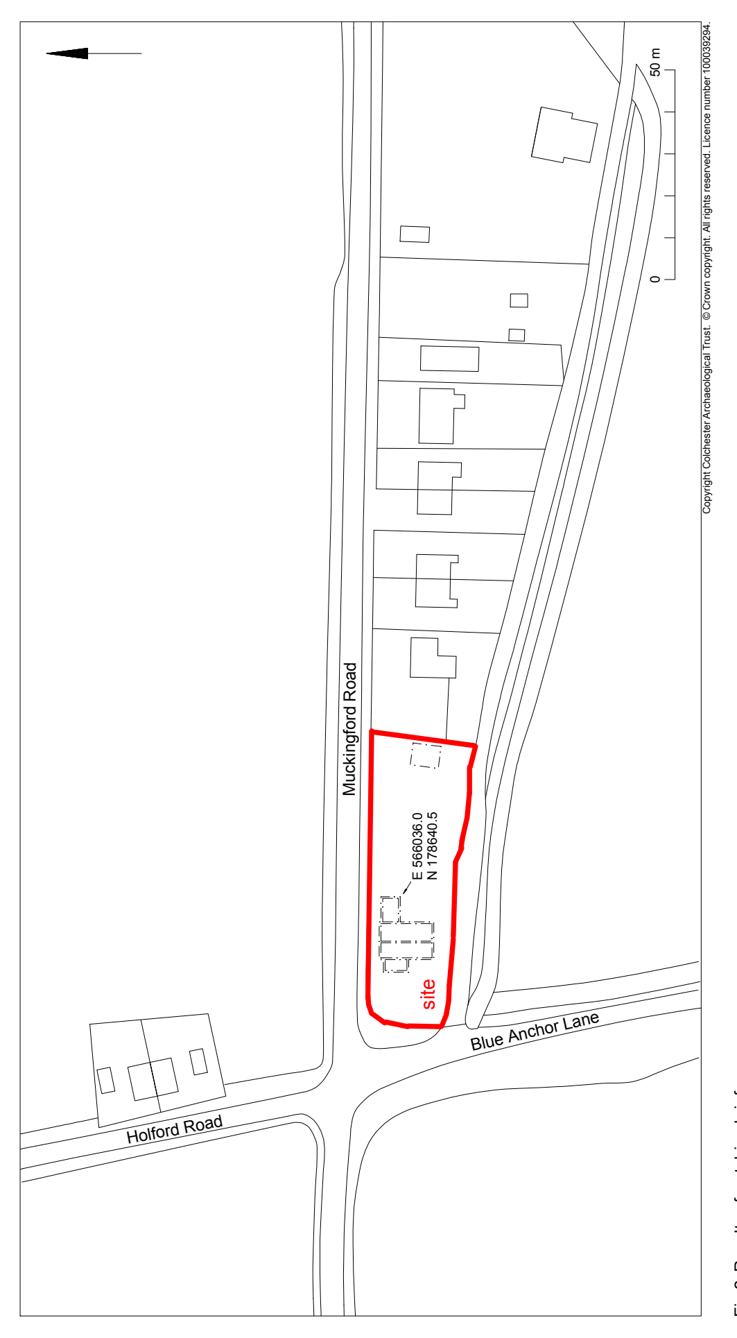
Fig 2 Results of watching brief.