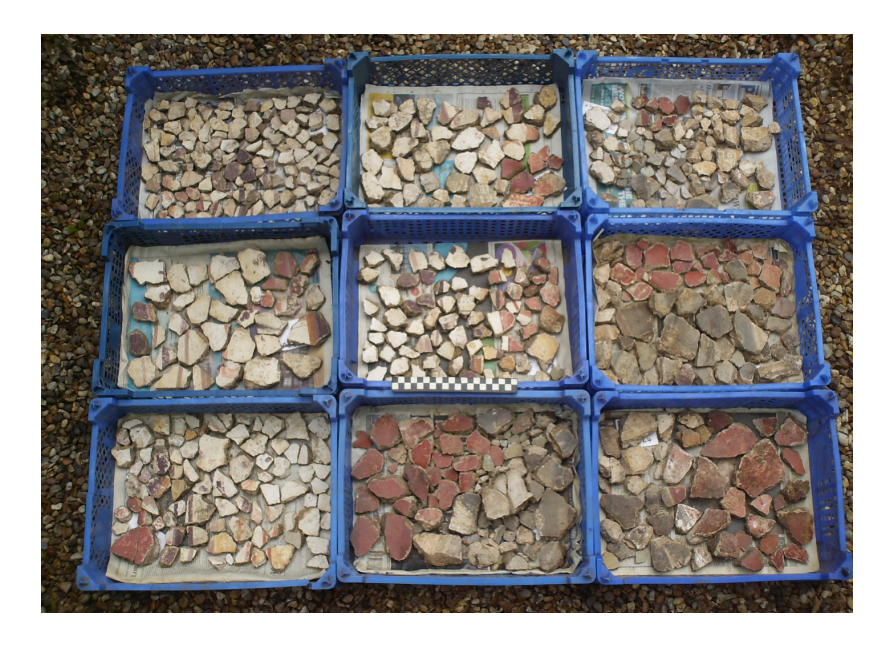
Plate 2: A selection of the fragments of Roman painted wall-plaster from L4.

In 2005-6, quantities of painted wall-plaster were recovered from layers of Roman demolition debris in pipe trenches to the south of the 2011 site (CAT Report 347, 42-3 & 49-52). There are some similarities between the two sets of finds in terms of the colours present, such as white, purple, red and grey. However, the 2005-6 assemblage included painted architectural and mythological elements including snakes. It, therefore, remains unclear whether the 2011 fragments are directly related to these or to any of the other groups of painted wall-plaster fragments found in the mid-site area in recent years.