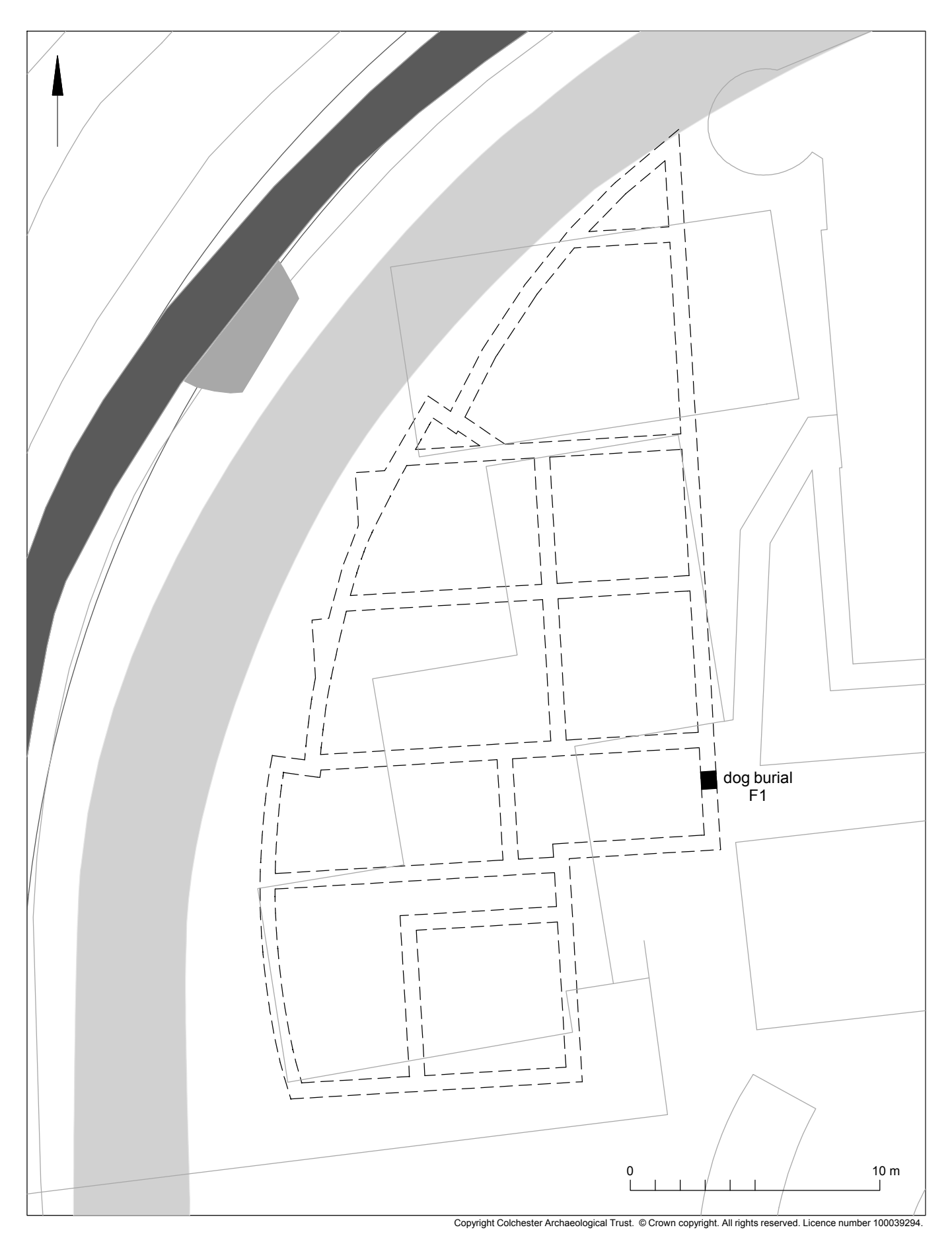
Fig 2 Site plan, showing the positions of the foundation trenches and dog burial F1 (plan of trenches supplied by the architect).