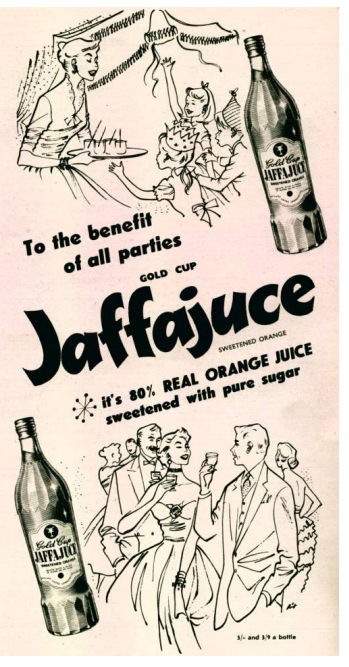
Plate 4: advertisement from http://www.historyworld.co.uk/ advert.php?id=715&offset=0&sort=0&l1= Food&l2=Soft+Drinks)