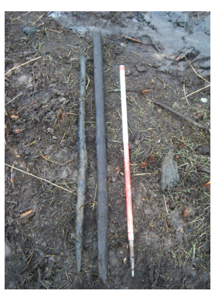
Plate 2: wooden posts.