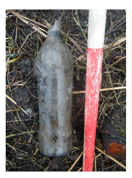
Plate 3: 'Jaffajuce' bottle, 1954.