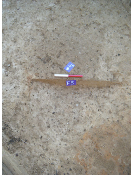
Plate 6: F5, view south-east