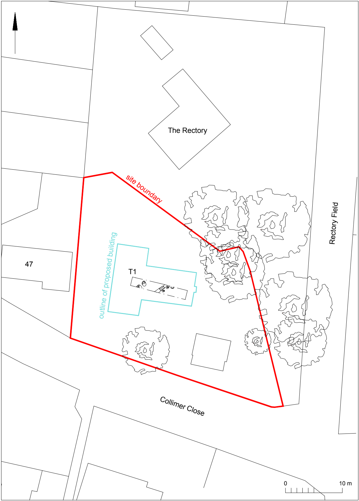
Fig 1 Site location.