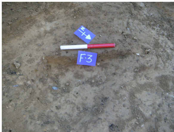
Plate 5: F3, view south-west.