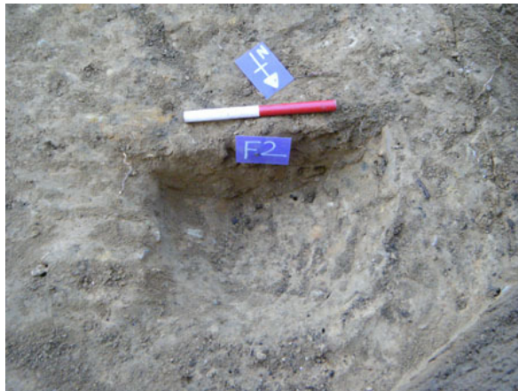
Plate 4: F2, view south-west.