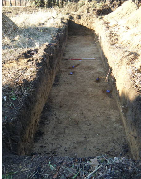
Plate 2: T1, view south-east.

topsoil horizon 650mm thick (L1), an accumulation deposit 200mm thick (L2), and into the natural geology (L3). There was no indication of any masking deposits, whether made ground (ie dumped soil) or alluvially or colluvially deposited material.