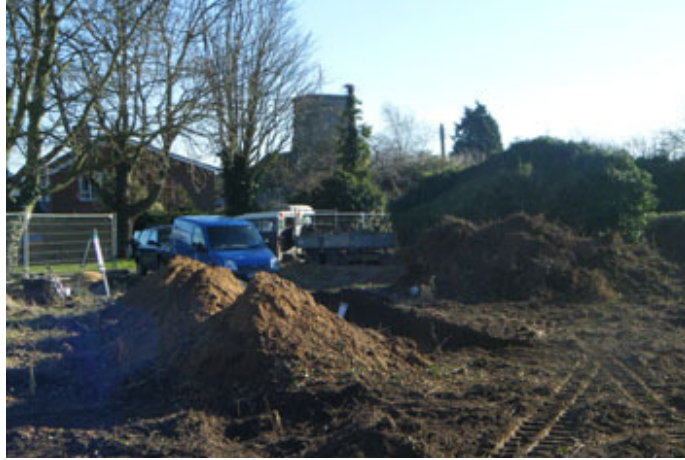
Plate 1: the site in the foreground, with St Andrew's Church behind, view north-west.

This section is based on records held by the Suffolk County Historic Environment Record (SCHER).