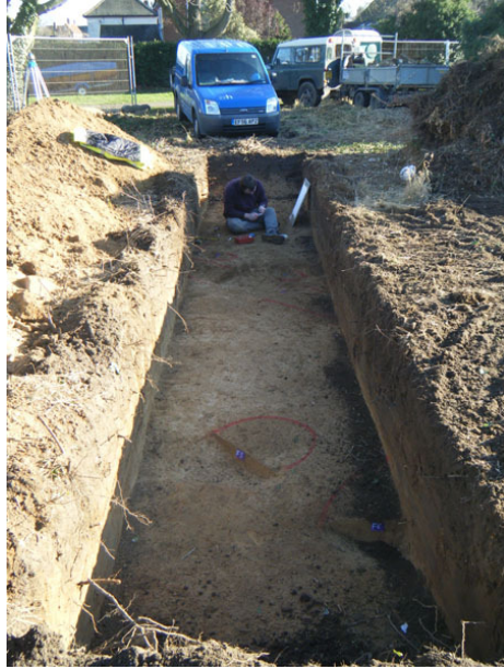
Plate 3: T1, view north-west.