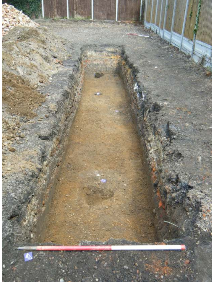
Plate 7: T3 view north. Post-medieval pit F3 in foreground, post-hole F1 and pits F2, F4 beyond.