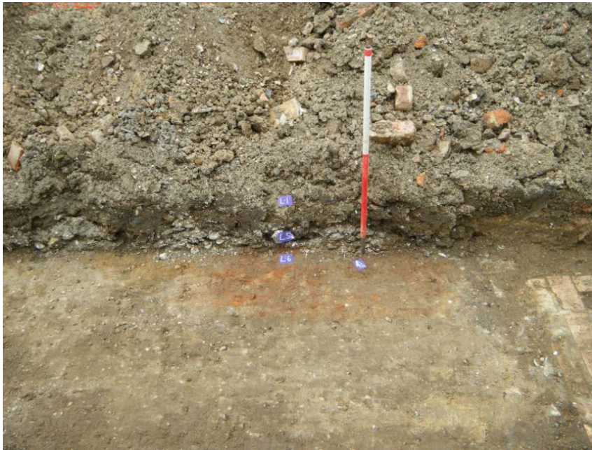
Plate 5: view north showing representative section of T2 (L1 topsoil over L5 oysters over L6 clay floor)