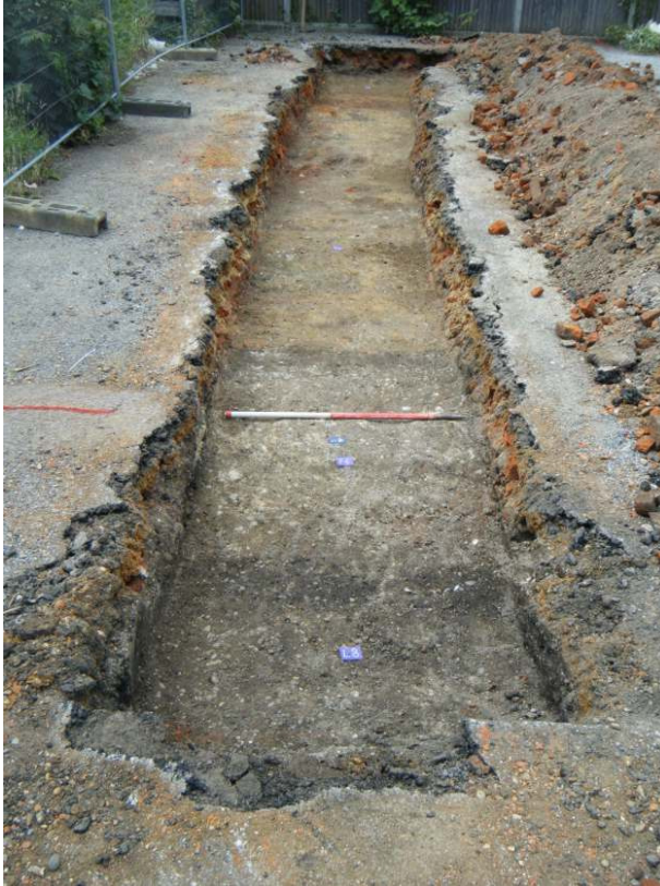
Plate 1: T1 view W. L8 (soily layer or yard surface) foreground, F6 (gravel or foundation), and L6 (clay floor) beyond. Bricky L2 visible in sides of trench under L1 tarmac.