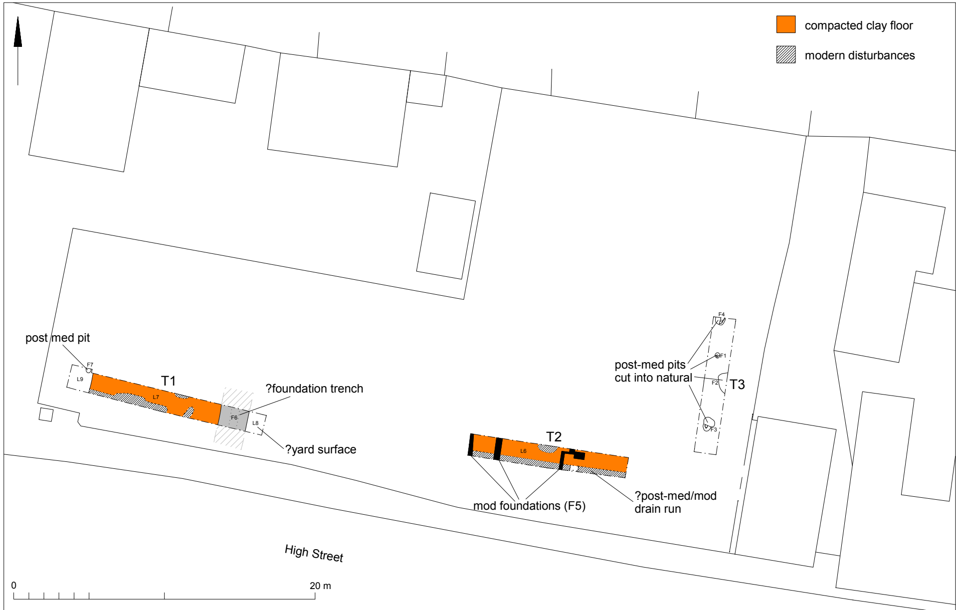
Fig 2 Results of evaluation