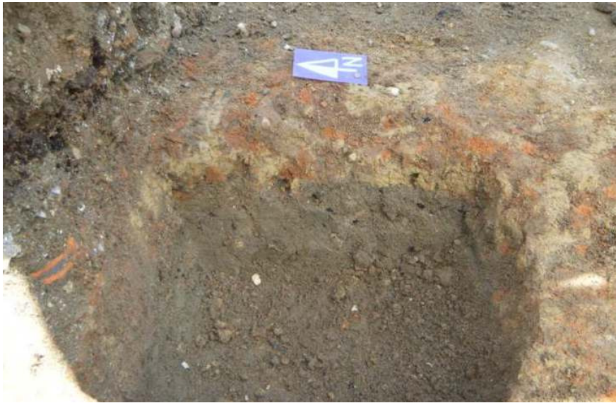
Plate 6: sondage showing thickness of clay floor L6 (65mm)