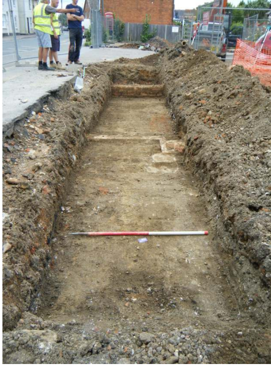
Plate 4: T2 view west. Modern brick foundation F5 centre