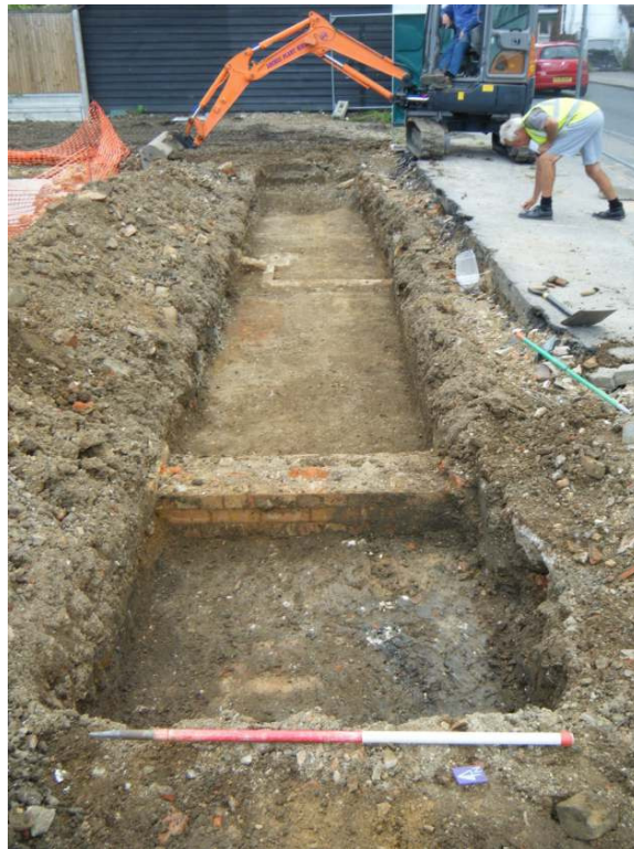
Plate 3: T2 view east. Modern brick foundation F5 foreground and centre