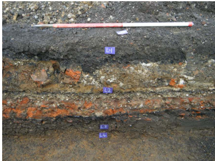
Plate 8: T3 representative section (topsoil/tarmac L1, over rubblely make-up L2, over L3 post-medieval topsoil, over L4 natural).