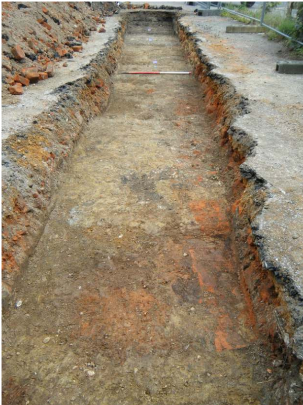
Plate 2: T1 view East. Clay floor L6 with area of burning (hearth?) foreground