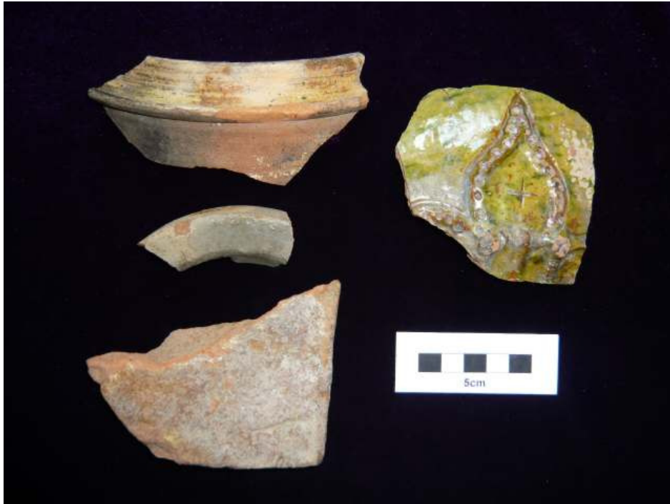
Plate 9: finds from L5 (overlying clay floor L6). Bottom left: glazed floor tile; top, 3 sherds of fabric 21a Colchester-type ware

A small quantity of bulk finds of medieval and post-medieval date, consisting of pottery, ceramic building material (CBM), vessel glass, clay pipe, animal bone and shell, was recovered from nine contexts divided between three evaluation trenches. There was also one metal small find (SF1). These finds are listed and described in Table 4. The medieval and post-medieval pottery fabric types recorded refer to the Essex post-Roman fabric series (Cunningham & Drury 1985; CAR 7 2000) and are listed in Table 5. Some of the sherds from L5 are shown in plate 9 below.