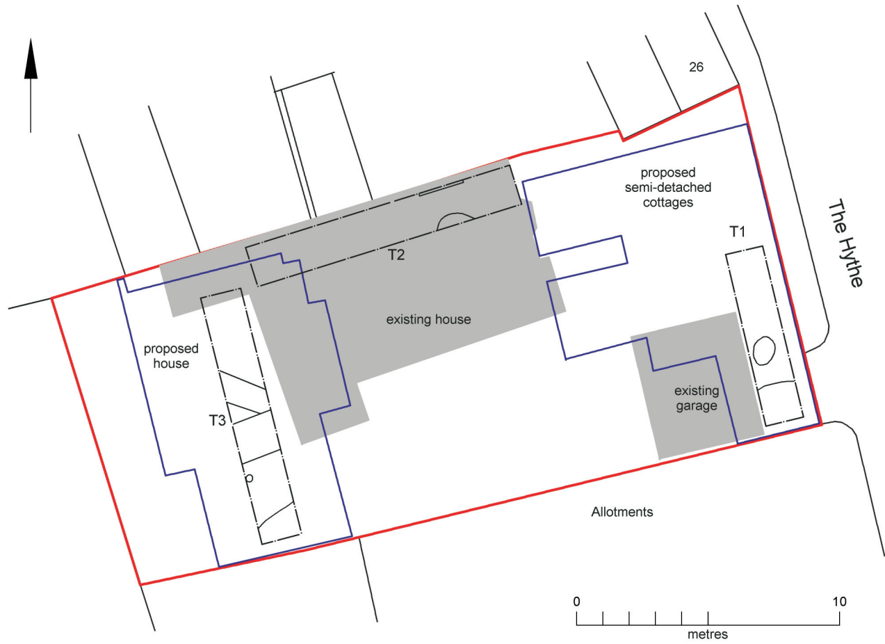
Fig 1 Site plan.