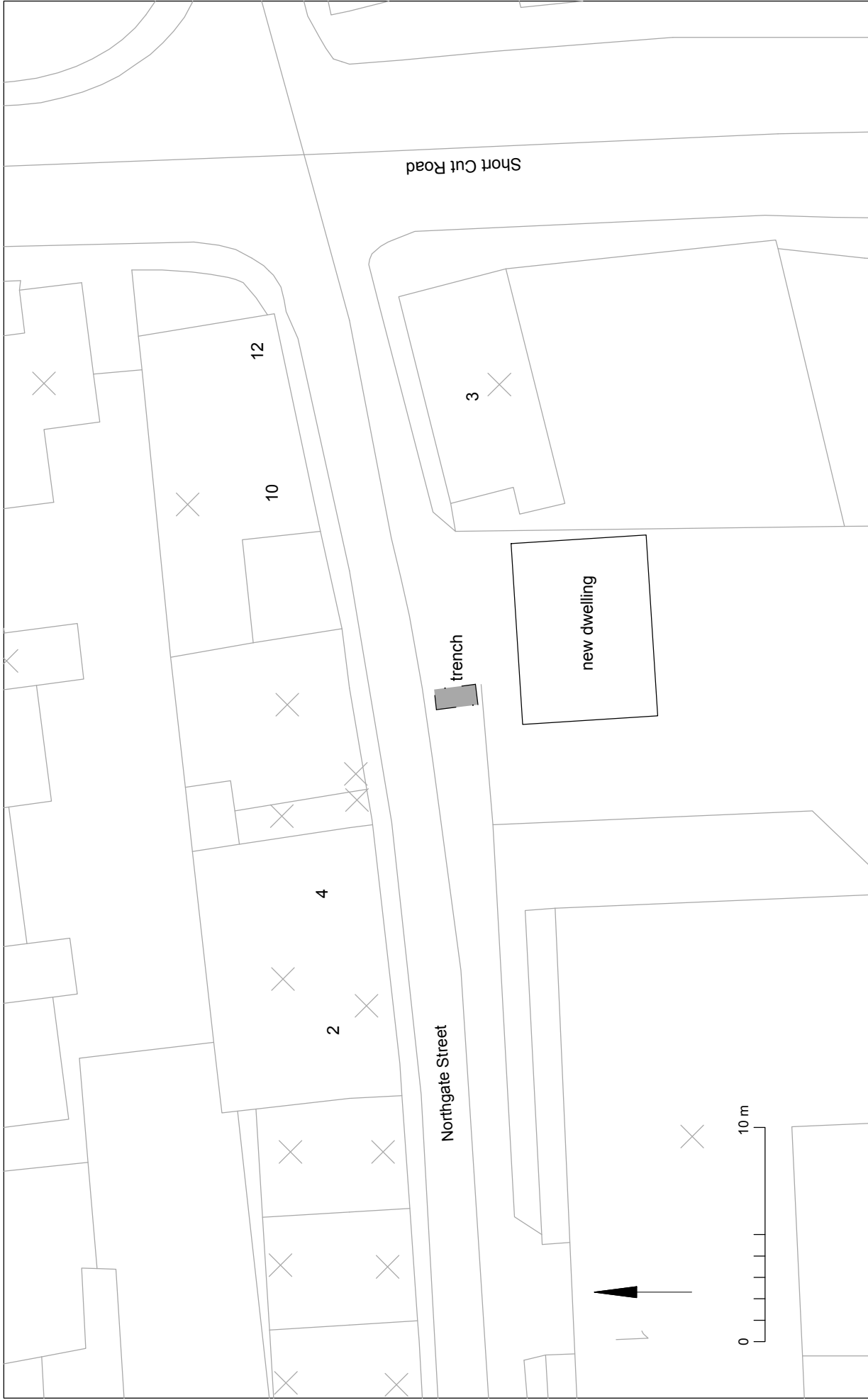
Fig 1 Trench location.