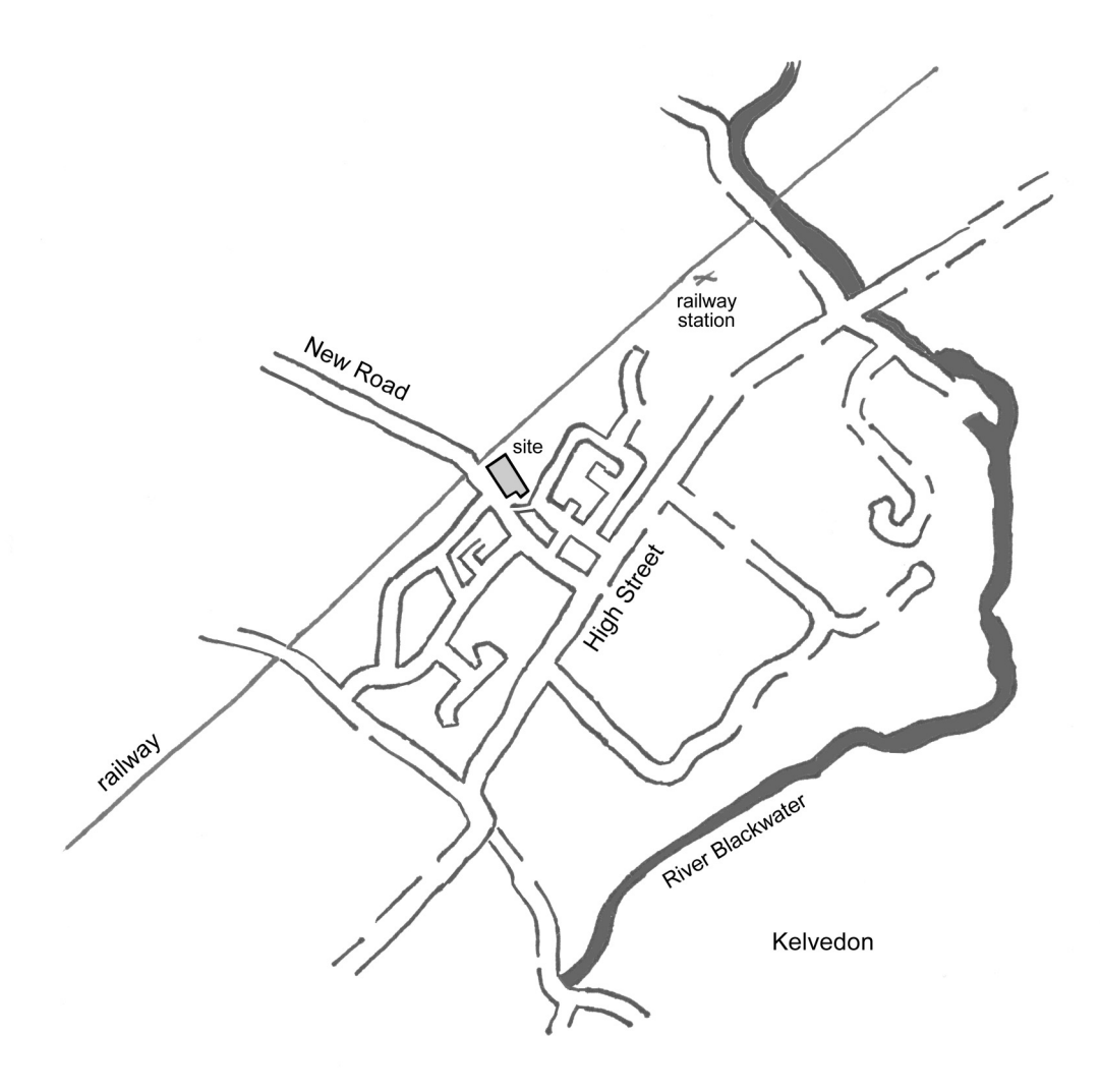
Fig 1 Location plan. (Not to scale.)