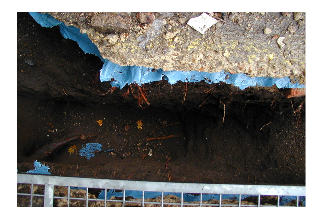
Plate 2 View of foundation trench showing human remains, view north-east.