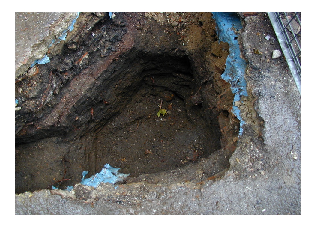
Plate 1 View of foundation trench showing human remains, view north.